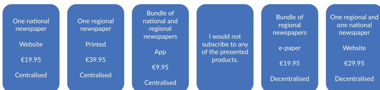
Figure 2. Exemplary presentation of the possibilities of choice in CBC.

The utilities derived from respondents’ choices were used to evaluate how attribute levels impact market share in simulated market scenarios. These simulations allow us to predict respondent behaviour in various market