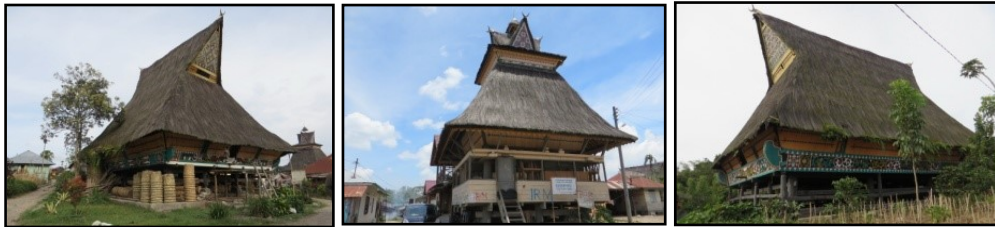
Fig. 6 – Desa Lingga traditional houses

Individuals with high self-esteem tend to be more committed than the ones with low self-esteem (Bankone and Ajagun 2014). In order to establish or create a commitment to a place, self-esteem, thus, must be improved. As more tourists visit a site, it will likely become a favorite neighborhood and enhance its self-esteem (Tigger-Ross and Uzzell 1996). Indeed, the rising tourism quality, as well as the commitment of visitors to a particular destination, will motivate them to visit the place more frequently and consequently make the local people more comfortable to live there. This will, in the end, grow a desire to develop the tourism (Fig. 6). In general, tourists and residents in the study area wanted to spend a significant time in the tourism area, and the five locations mostly get a high rating from the tourists and the residents.