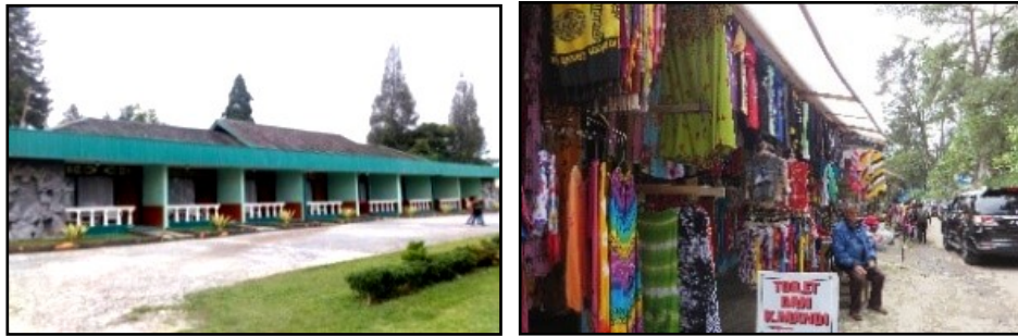
Fig. 3 – Lodgings in Bukit Kubu and stores in Bukit Gundaling

example of interview with a respondent: “The cost of lodging in Bukit Kubu is quite affordable, and it has good tourism attractions. Tourists can also enjoy the panorama of the Green Hill from the inn there” (Main respondent: Tourism Figures).