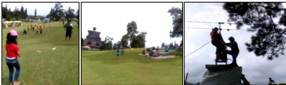
Fig. 5 – Tourist Activities in Bukit Kubu

In general, respondents were happy in the TTDs. The attachment shows visitors some privacy and family togetherness (Harris et al. 1996). This particularly becomes obvious in Bukit Kubu, where domestic and foreign tourists and local people were very happy to perform various activities together with their families (Fig. 5). This is supported by the following interview with a key respondent: "The most popular tourism attraction by domestic tourists in Karo Regency is at Bukit Kubu. It is often used for meeting place which enables tourists to refresh all day and spend the weekend in Bukit Kubu. It seems that the current tourism attraction trend in Karo Regency is Bukit Kubu" (Main resource: Hotel Manager at Berastagi).