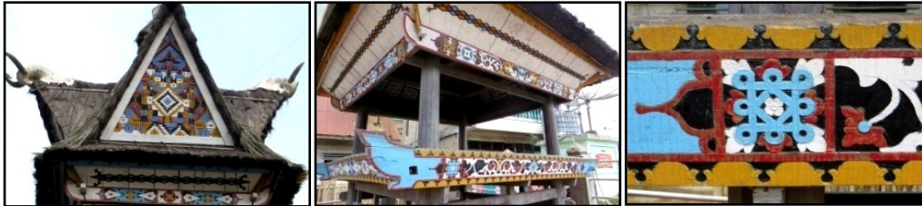
Fig. 4 – Physical symbols and characteristics of traditional houses in Lingga village

The main characteristics of place attachment becomes someone's desire in order to manage an intimacy with an object (Brown and Perkins 1992). It also describes a particular feeling to a place (Hidalgo and Hernández 2001). In the studied areas such as Berastagi and Sipiso-piso waterfall, people in the TTDs felt that they were part of the place. They enjoyed and felt happy when they were in the locations. However, it can be seen that some tourists still considered themselves as strangers to those places, like Pasar Buah, Bukit Gundaling, and Desa Lingga. The results show that the five tourism attractions brought less meanings to the foreign tourists, but not to the domestic tourists. Another factor of attachment, that is functional and emotional attachment, also holds significant roles in establishing place identity (Ujang and Dola 2009, Ginting et al. 2017).