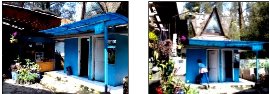
Fig. 2 – Public toilet in Pasar Buah

As one of the factors in evaluating a place, public toilets contribute to creating a comfortable environment (Ja'afar et al. 2012). In the studied area, the easiness of finding public toilets obtained poor rating by the average respondents. The public toilets in the fruits market were not available at strategic locations (Fig. 2), making them difficult for travelers to find them and there were no signs guiding the tourists to the public toilets. Furthermore, the ease to find the information center was also poorly rated in the studied tourist sites. Moreover, the quality of services and facilities, as well as the satisfaction to the two aspects would improve the long-term relationship with the tourists and it made them comfortable to the place. Therefore, the further improvement of facilities was required.