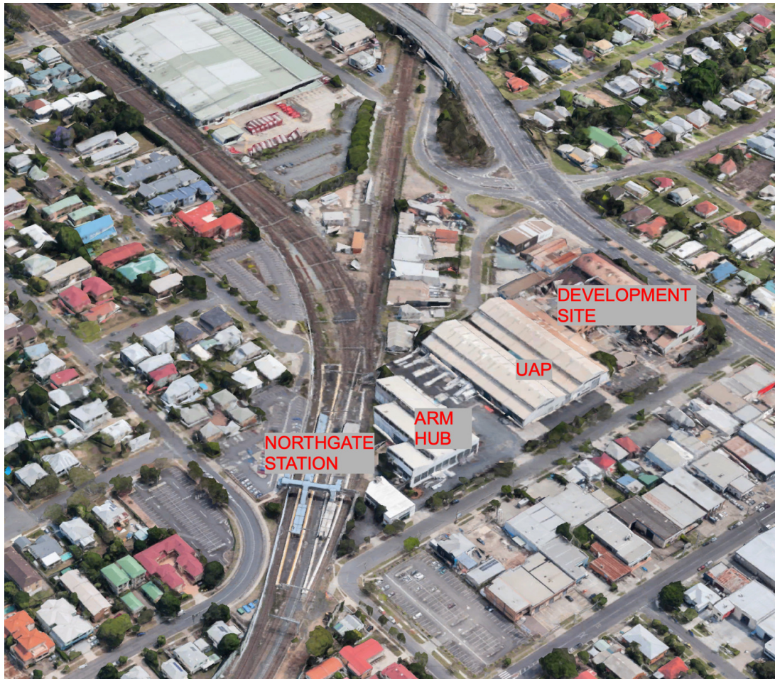
Figure 2. ARM Hub and UAP in Holland Street.

to enhance the traditional character of the area and also allow redevelopment to cater for a broader range of dwelling solutions. Industrial tenants of Northgate in the present day are a wide variety of manufacturing, warehousing, industrial services, some boutique brewers, a salvage yard, mechanical services, and industrial cleaners. Virginia also has a variety of different activities, ranging from large retailers, workshops, food processing and production, and services to the construction industry. The Northgate Industrial Estate is located within several hundred metres of a motorway with connections to Brisbane Airport and the major tourist destinations of the Gold Coast and Sunshine Coast. The greater area is in fact served by four railway stations and two different lines.