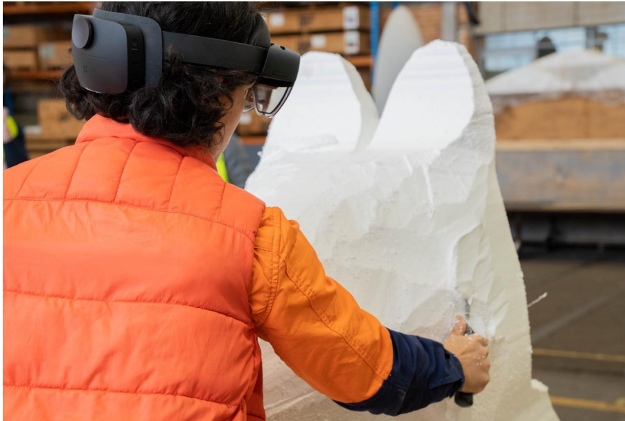
Figure 5. Using AR to sculpt forms for casting.