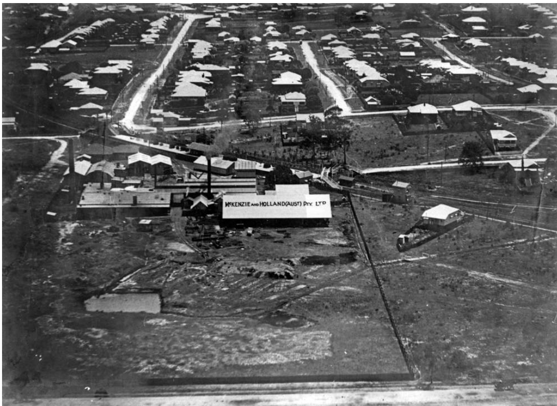
Figure 1. Site of Northgate station and current Holland Street, 1916.

On the western side of the railway line, significantly more residential activity can still be found today, including the transit adjacent development of Nundah (Figure 3). Together, Northgate and Nundah currently have a combined population of around 20,000 people. The industrial district spanning Northgate, Virginia, and Banyo, is currently promoted by the local government as a valuable asset for the city. Brisbane City Council, in its 2019 Banyo-Northgate Neighbourhood Plan, aims to create two employment districts catering for more than 5,000 jobs (Brisbane City Council, 2019). At the same time, the plan aims to protect pre-1911 buildings