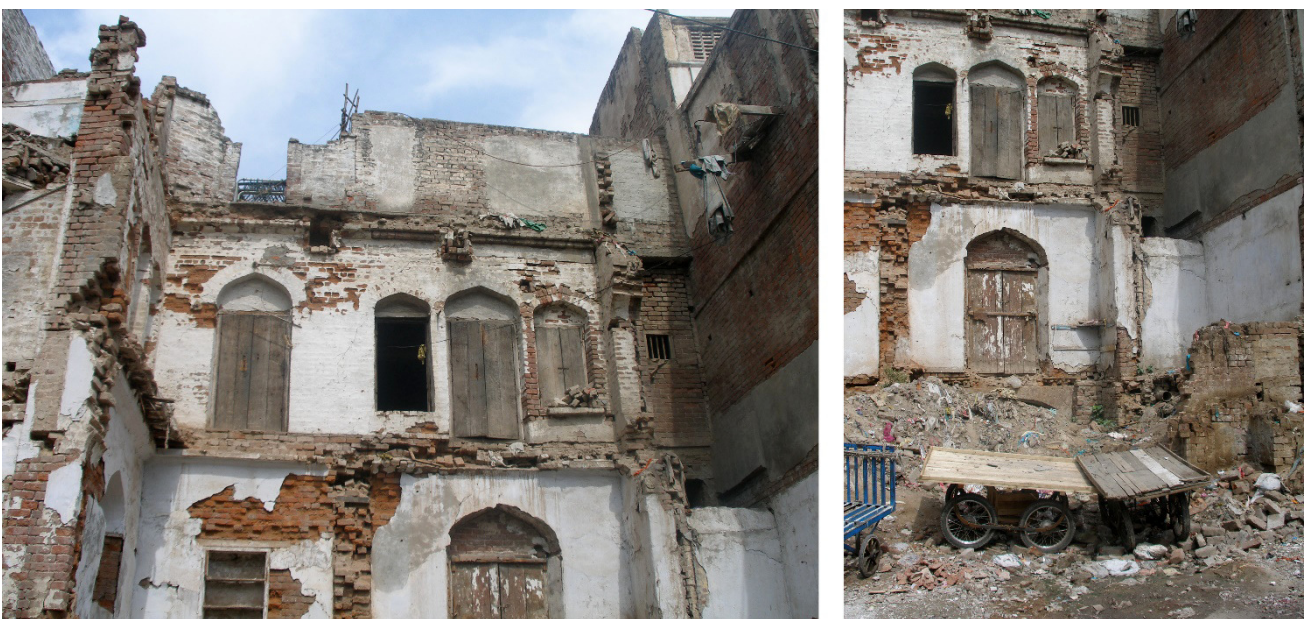
Figure 2. Dilapidated house in the Walled City.

in Figure 5. Land use has changed significantly from residential to commercial (Figure 6). As low-income residents are unable to invest in the improvement of their houses and are increasingly threatened by the potential collapse of built structures, they often end up selling their properties to a growing “land mafia”