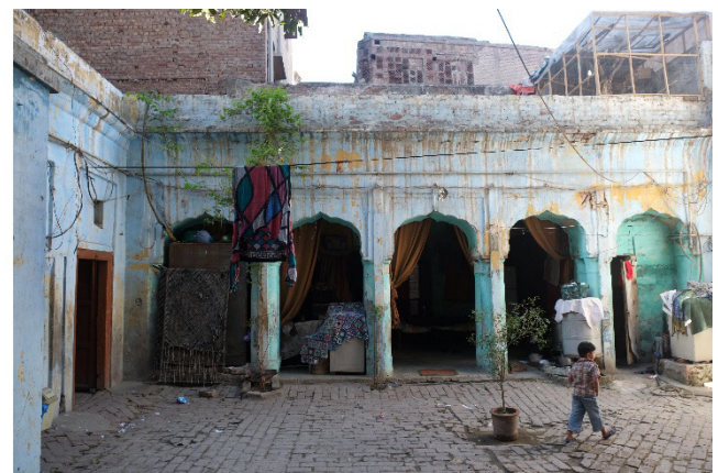
Figure 9. The interior of haveli Dina Nath on the left and courtyard on the right.