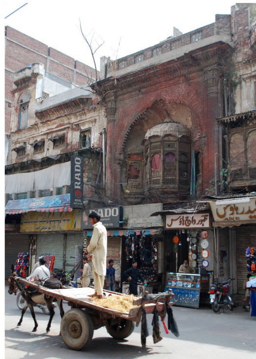
Figure 4. Carved wooden windows and jharokas.