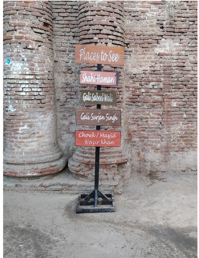
Figure 8. Mohalla Gali Surjan Singh on the left and sign plates announcing touristic places in the Royal Trail on the right.

the establishment of an on-site social mobilisation office and the commitment to involve the local communities at all stages of the project, from planning to implementation. The fragile participation component was accompanied by selective development, for not all houses benefited, and priority was given to improving facades. Over the years, the pilot mohalla of Gali Surjan Singh has come to be known as a showcase for development and a touristic attraction. Yet, it remains highly contested among residents of neighbouring quarters who criticised the disproportionate effort undertaken to develop a “few houses” and selected havelis (traditional townhouses with court-