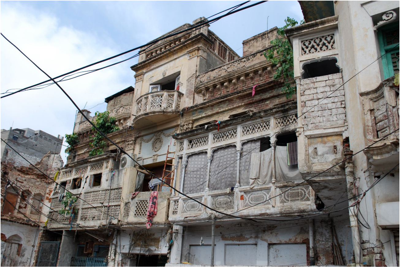
Figure 1. House in the Walled City with decorative designs on its facade. Photo by Katja Mielke (2012).

doors and jharokas (upper story windows projecting from buildings' walls) are gradually falling apart, as seen in Figure 4. Abandoned religious premises, such as Sikh gurdwaras and Hindu temples—under the custodianship of the Evacuee Trust Property Board—serve as ramshackle housing or commercial properties as shown