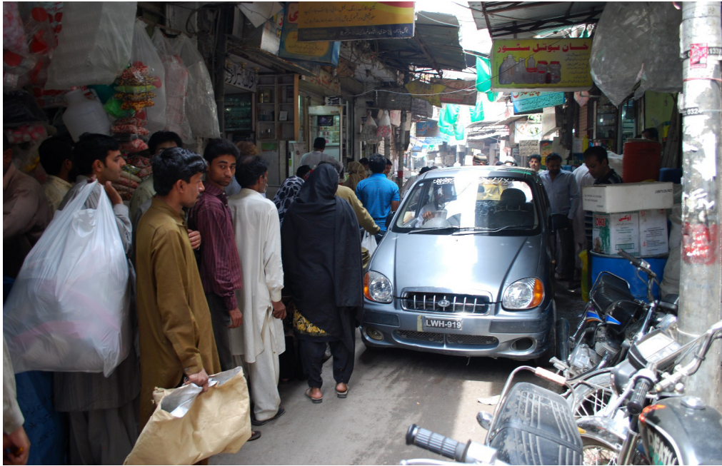
Figure 3. Congested street in the Walled City.

that transforms these further into commercial “plazas,” outlets, storage, and manufacturing spaces (residents of Delhi Gate area, interviews, September 28, 2015; Walled City of Lahore Authority [WCLA] officials, interview, October 28, 2015).