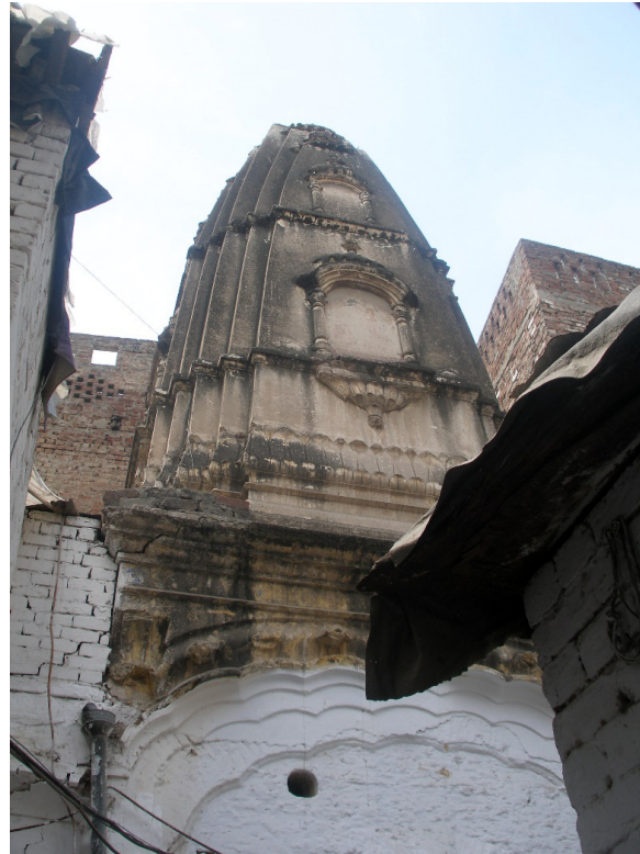
Figure 5. Remaining of Hindu temple currently used as housing.

Project—a collaboration of LDA with the World Bank and the Punjab government—and within it, the 1988 “Conservation Plan” for the Walled City of Lahore (commissioned by LDA to the Pakistan Environmental Planning and Architectural Consultants). This study compiled an inventory of ca. 18,000 structures, identifying thousands of significant historic buildings—the exact number, though, differs between sources—of which ca. 1,400 were considered worthy of protection for their “historical” and “architectural” value (SDWCLP, 1993/2009). Since designation did not entail de facto immediate conservation action, a significant percentage of these historic buildings deteriorated further with time (M. Khan & Rabi, 2019). In many cases, interviewed residents often criticised LDA for their inaction concerning the deteriorating living conditions and the irregular practices or land use transformation in the Old City. At the same time, they reported having received LDA leaflets instructing them to vacate their insecure houses amid the progressive ruination of dwellings (interviews and fieldnotes, September 2015).