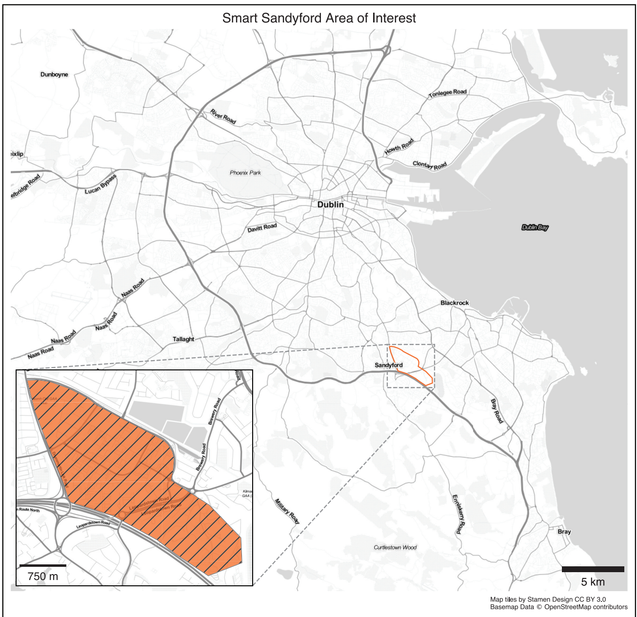
Figure 1. The location of Smart Sandyford. Map designed by Stephan Hügel.

Workshops with business representatives prior to the launch of Smart Sandyford identified improved