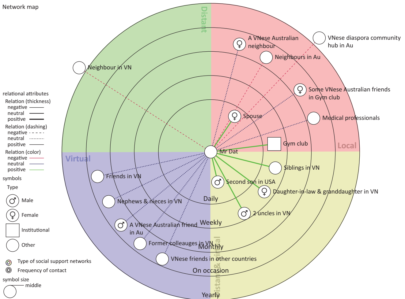
Figure 2. Illustration for digital kinning practices of a grandparent migrant.