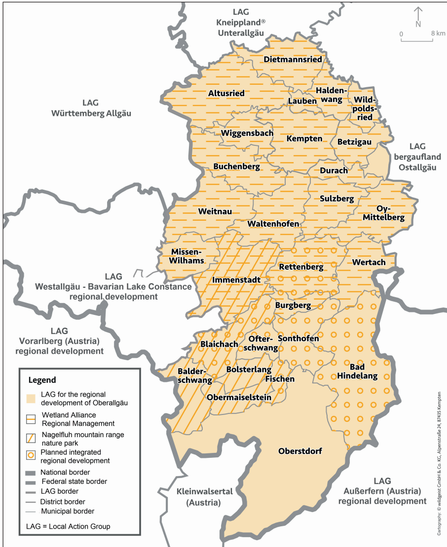
Fig. 1a: The research area of the Local Action Group Oberallgäu