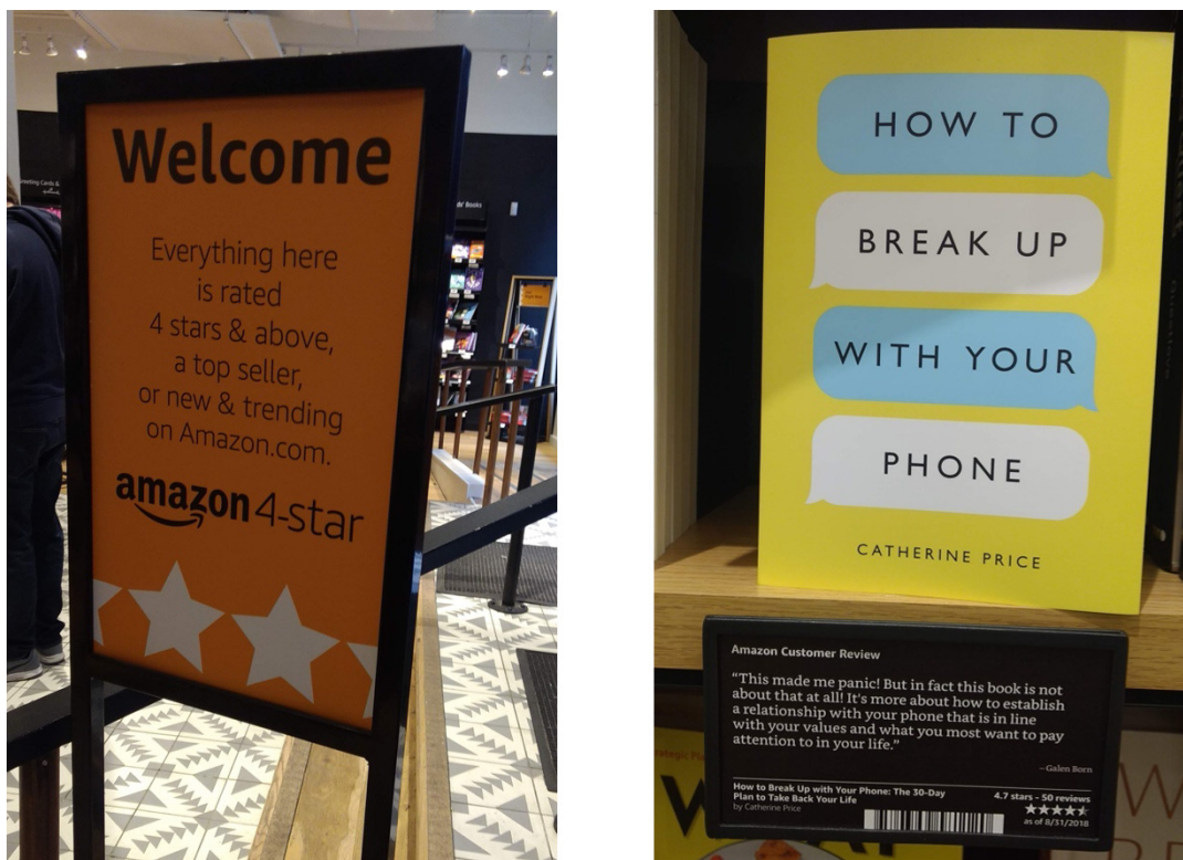
Figure 1. Signage at Amazon 4-Star in New York City.

Around the time of Prime's launch in 2005, social media platforms began to explode. Facebook groups and other online spaces, eventually including Slack, Discord, Telegram, and subreddits, became convenient places to recruit people willing to write glowing reviews and leave five-star ratings in exchange for a fee, or even just for the free product or a rebate (Nguyen, 2018a). Sellers also buy Facebook ads offering free products, linking users to chat-bots that organize the entire transaction (Nguyen, 2019a).