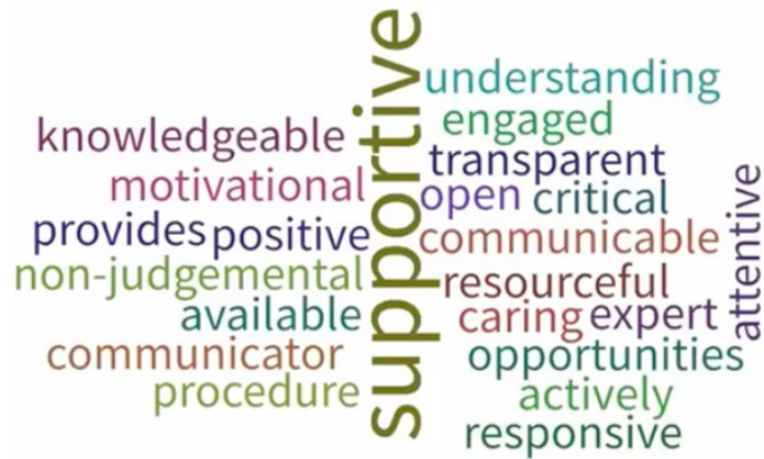
Figure 2: Word cloud

software may optimize the online focus group experience. Aside from the occasional issue (buffering, broken link, etc.), participants felt the use of these tools, as well as the usability of Zoom itself, gave all of us the opportunity to fully engage.