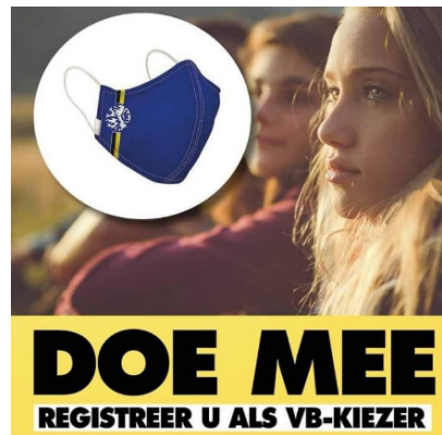
Figure 2. VB Facebook graphic advertising free face masks.

successful political movements elsewhere, where social media campaigning is paired with labour-intensive supporter mobilisation (Kefford, 2018, p. 659). Party elites referred to Donald Trump’s campaign social media and rallies as an inspiration (Interviews 14, 30, 32).