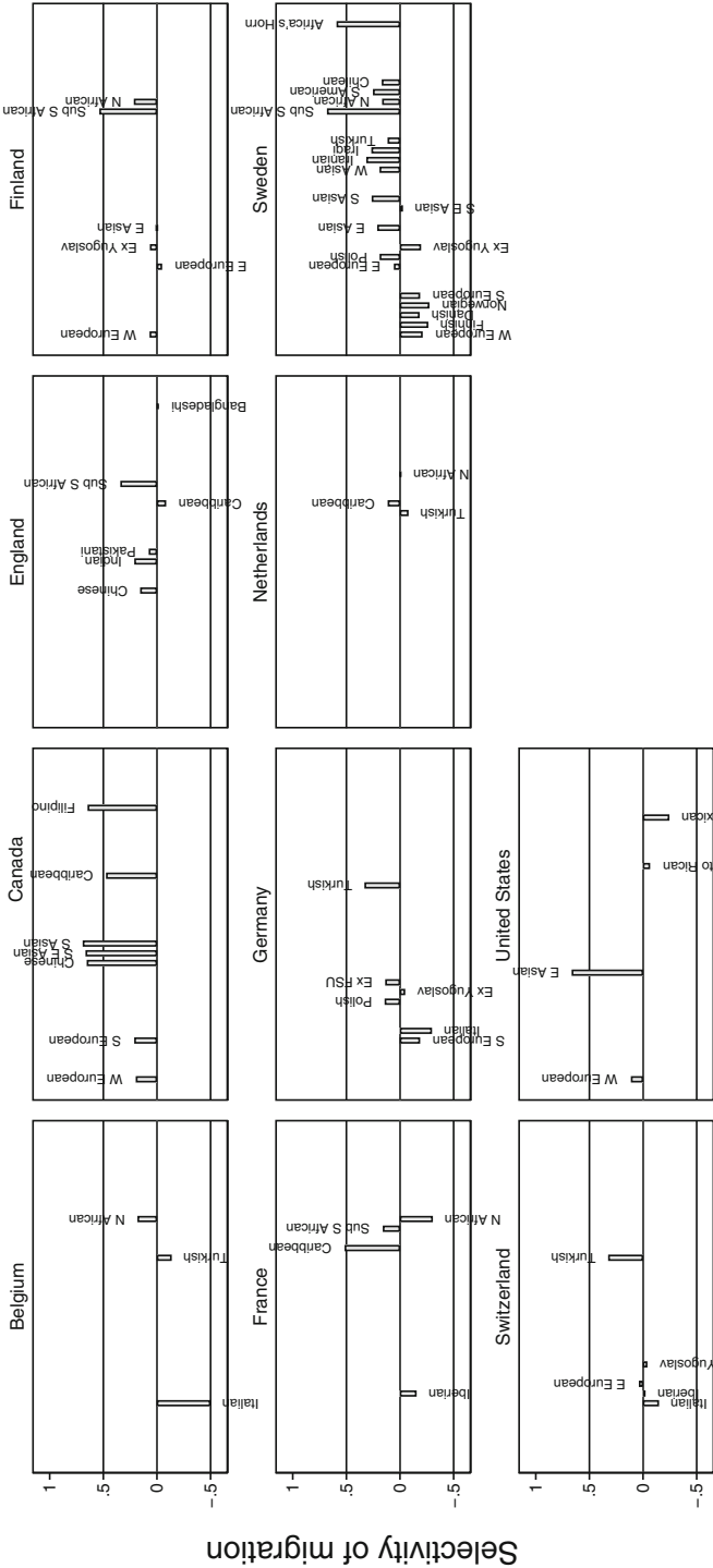
Note: 'Other' ethnic groups have been assigned the mean selectivity score. Mixed ethnic origins have been assigned the score 0