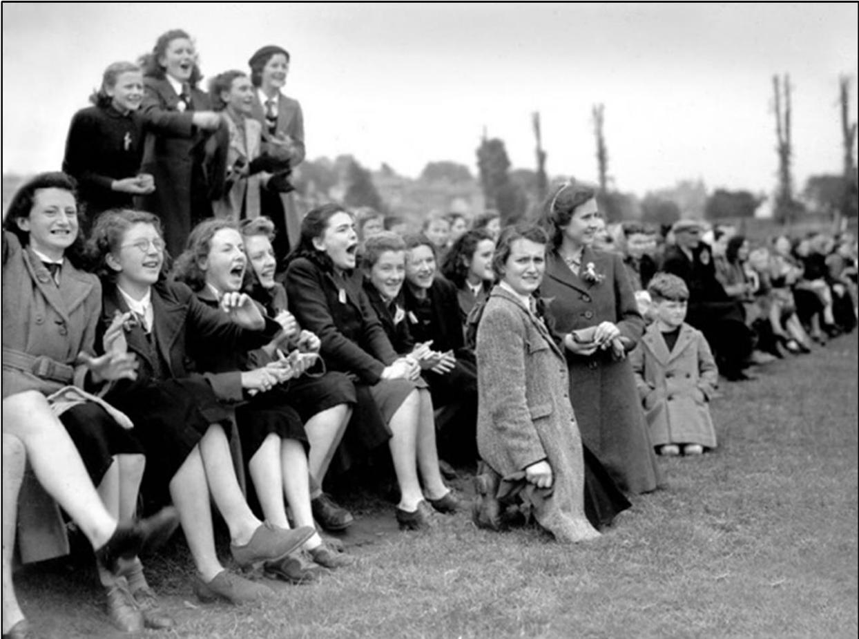
A section of the attendance at the school final of 1946 at the Mardyke.