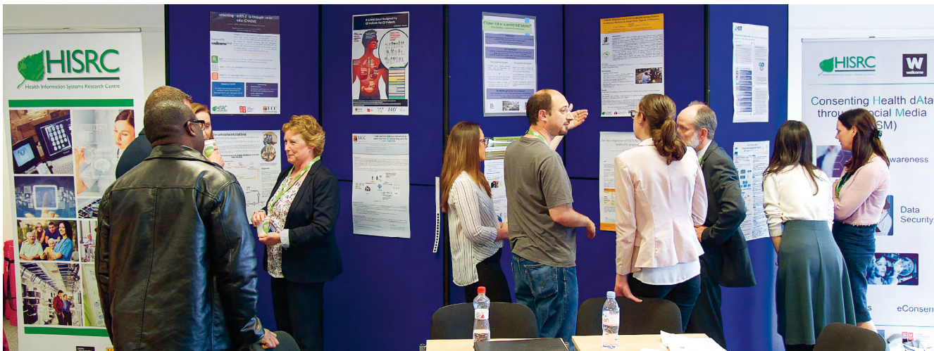
Fig. 1: Intensive discussions in the poster area of the 3 rd European TA Conference.