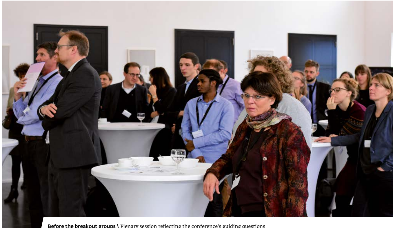
Before the breakout groups \ Plenary session reflecting the conference's guiding questions