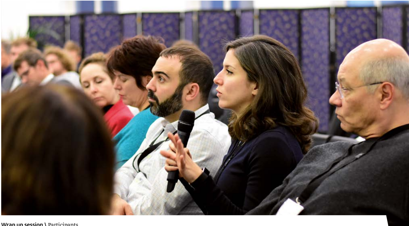
Wrap up session \ Participants

Beyond the three blocks of questions, several synthesis messages can be deduced. We suggest that these are followed up in further discussion formats that involve decision-makers, implementers and scholars: