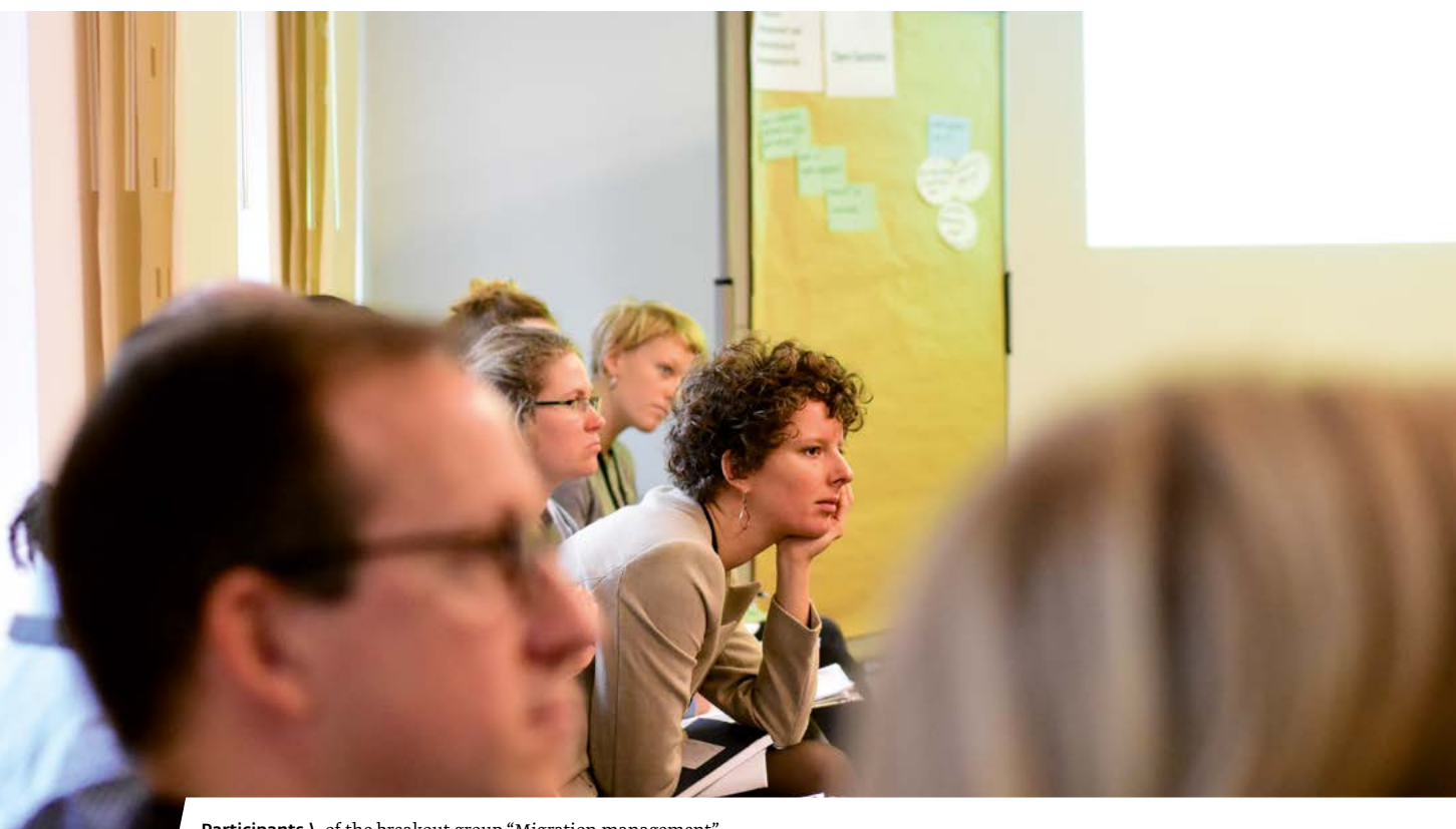
Participants \ of the breakout group “Migration management”

Many of the programmes that are implemented under the umbrella of migration management, such as the Khartoum Process, the European Trust Fund for Africa or BMM, work with despotic or authoritarian regimes, which discussants criticised strongly. Practitioners from the development sector argued that these programmes neither aim at stabilisation nor legitimise authoritarian rulers but are rather a tool for development to improve the delivery of basic services to nationals and non-nationals in the respective countries. Conversely, human rights advocates raised the concern that training police forces and delivering surveillance technology or cooperating with militias has detrimental effects on the upholding of human rights. Both sides agreed that the blurry concept and often differing understanding of stabilisation of the actors involved lead to a strong variance on the interpretation, usage and