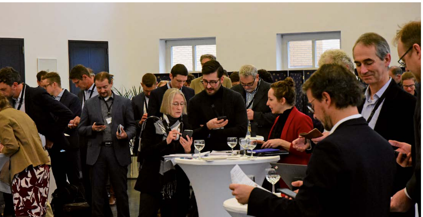
"What is your perception of stabilisation?" \ Participants polling at the very beginning of the conference