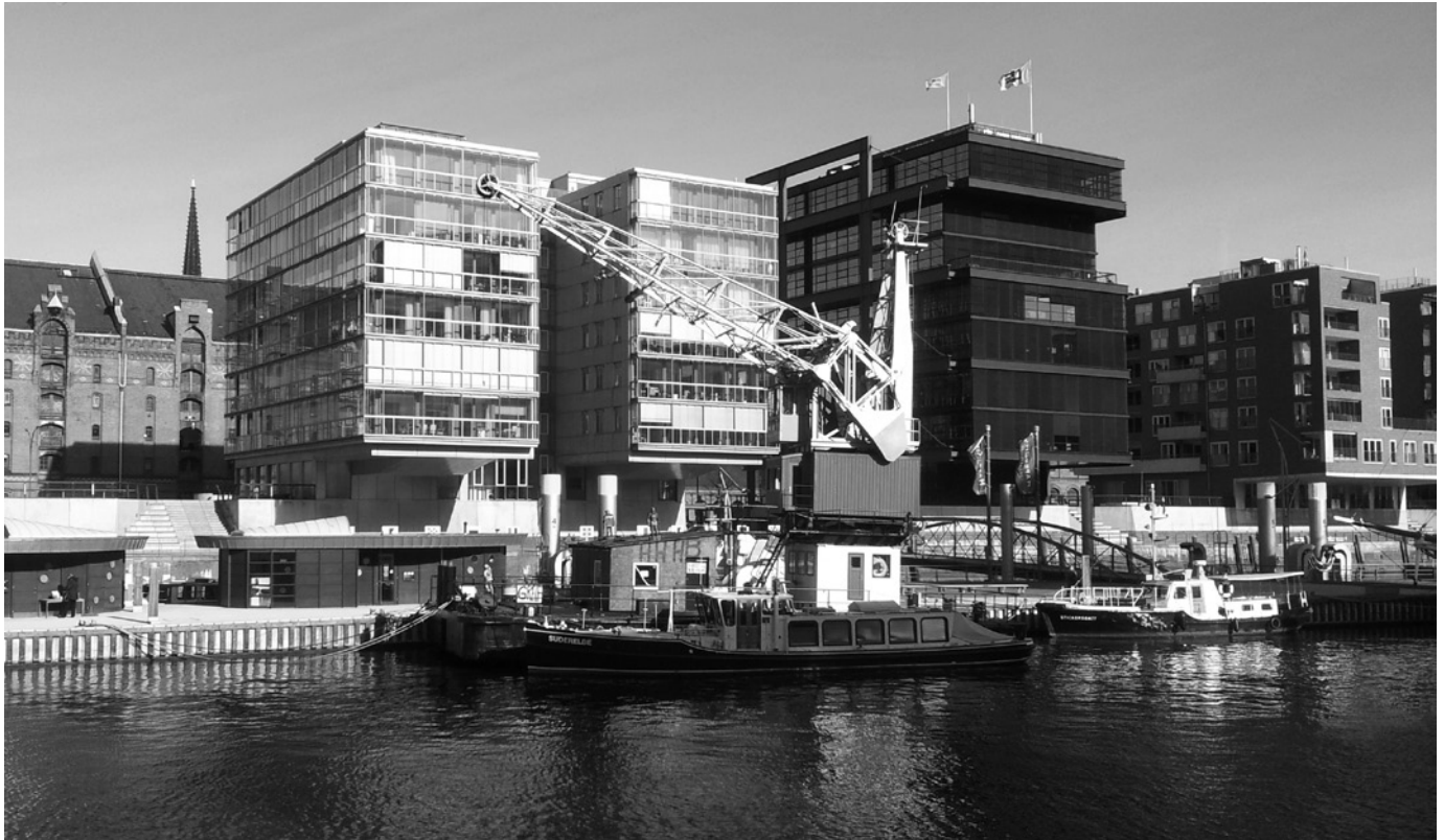
Fig. 2: The renewal of the southern part of the warehouses district (Speicherstadt), included in the Hafencity project combines symbolic remnants of the former logistics activity (crane, brick facades in the background) with new buildings in an international style, dedicated to business services (Depraz 2014)

observed in the local architecture, such as the Unilever and Marco Polo towers, intentionally qualified as “impressive” and “spectacular” on the project website 4 .