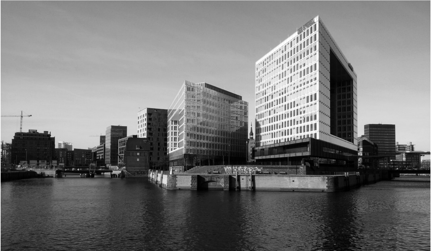
Fig. 1: The Spiegel headquarters, built between 2007 and 2011 by the Henning Larsen Architecture Company (Denmark), are marking the Hafencity renewal area from the railways entering Hamburg at the east of the city-centre (Depraz 2014)

life within city-centres 3 . It is now used to summarise, in a broader sense, a more comprehensive analysis of the city, including the mutation of economic activities, of collective representations and daily practices towards a post-industrial city: “Underlying all of these changes in the urban landscape are specific economic, social and political forces that are responsible for a major reshaping of advanced capitalist societies: there is a restructured industrial base, a shift to service employment and a consequent transformation of the working class, and indeed of the class structure in general; and there are shifts in state intervention and political ideolo-