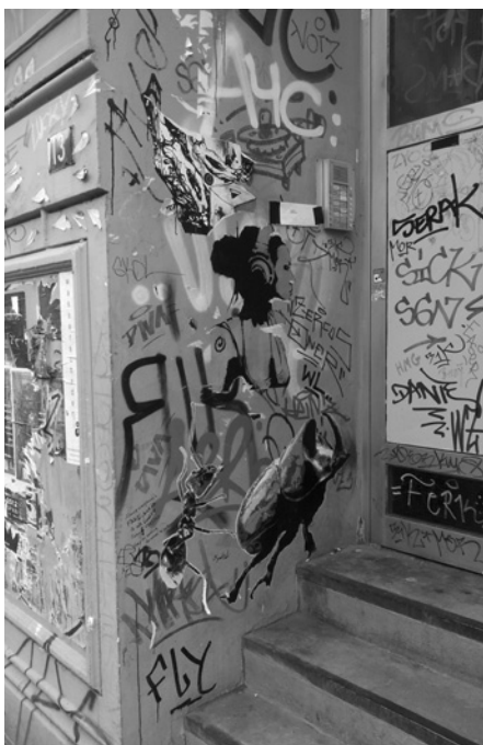
Fig. 5: Graphic designs expressing an indirect social protest on the feet of buildings in Sternschanze (Rosenhofstraße) (Depraz 2014)

agreements, before getting regularised during the 1990s. In between, they sought to prove the viability of their housing by upgrading the infrastructures to current standards thanks to a self-management association. Nowadays, the occupants still cultivate an alternative way of life demonstrated through mural paintings, ephemeral artistic productions and a free radio station. However, the atmosphere is still marked by conflicts: administrative control remains frequent and causes some violent answers; bills are not regularly paid and the police often raid the apartments on suspicion of involvement in terrorism. The Hafen Street houses thus remain the symbol of an alternative activism and of an urban space freed from any social alienation – or a no-rights zone, depending on one's view.