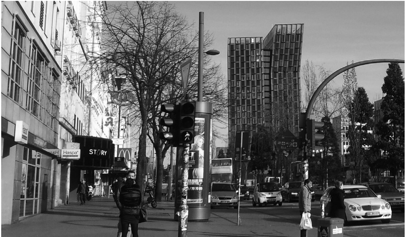
Fig. 4: A sharp contrast appears on the Reeperbahn, with its outdated street furniture and its ageing functional architecture on one side, and the “dancing towers” (2012) on the other side, an iconic building that reveals the ongoing re-conquest of the city by metropolitan upper functions (Depraz 2014)

cit.). The notion of “gentrification front” (SMITH 1996; ATKINSON a. BRIDGE 2005; CLERVAL 2010) makes perfect sense when, in the same street, the bay window of a gastronomic restaurant on one side coexists with, on the other side, the squat houses of the red district with their greasy spoons, their stalls for low-quality importation products and their prostitutes (WISCHMANN, op. cit.).