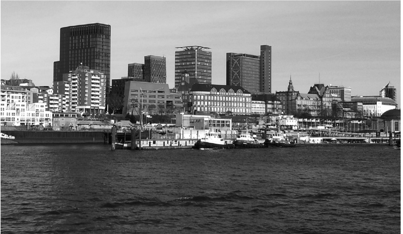
Fig. 3: The new skyline in Sankt-Pauli produced by the renewal of the site of the Bavaria brewery (Depraz 2014)

metres segment, a sharp speculative soaring in housing prices was observed in the area when the last building phase was launched, at the beginning of 2015. Apartments for sale were rated at 8,920 €/m 2 , compared to 3,555 €/m 2 on average for the whole agglomeration 6 . Therefore, 20 % of the housing offer had to be secured with subsidized building schemes or social leases.