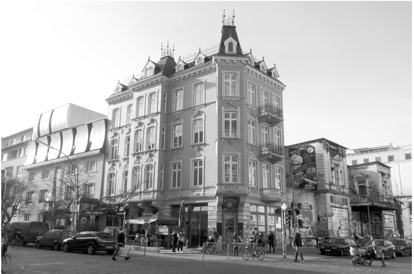
Fig. 6: The crossing of the Schulterblatt Street and the Julius Street in Hamburg. The squatted Rote Flora theatre, on the right, stands in sharp contrast with an architect house on the left. This street corner was at the heart of the Dec. 2013 demonstration in Hamburg. (Depraz 2014)