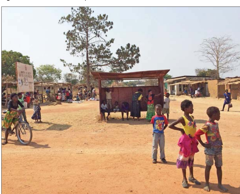
Figure 4. Former Bus Stop in the Kafubu Block

Perhaps nowhere was the sense of stagnation more apparent than in the area that began as the regional centre for the Kafubu Block. Structures built around the old village square are still standing, and community meetings still conducted in the former administrative buildings. Small shops still operate, although they now sell mobile airtime and palm wine rather than farm equipment (Figure 4). Former settlers took us around the remains of the structures built by the Israelis, bemoaning the disrepair. Some of this former project infrastructure has been repurposed; this was the case, for example, with the bus stop originally built at the Kafubu Block village centre. It still stands in the centre of the village square, although there is no road running through the Kafubu Block and certainly no buses do either. But the structure is still in use, serving as a central point of reference, a meeting point, and also just a shaded spot to sit in (Figure 4). This combination of material durability alongside renovation and reinvention echoes Straube's work (2018) examining similar processes of "reimagining" with regard to communal structures throughout the Copperbelt following the onset of economic decline.