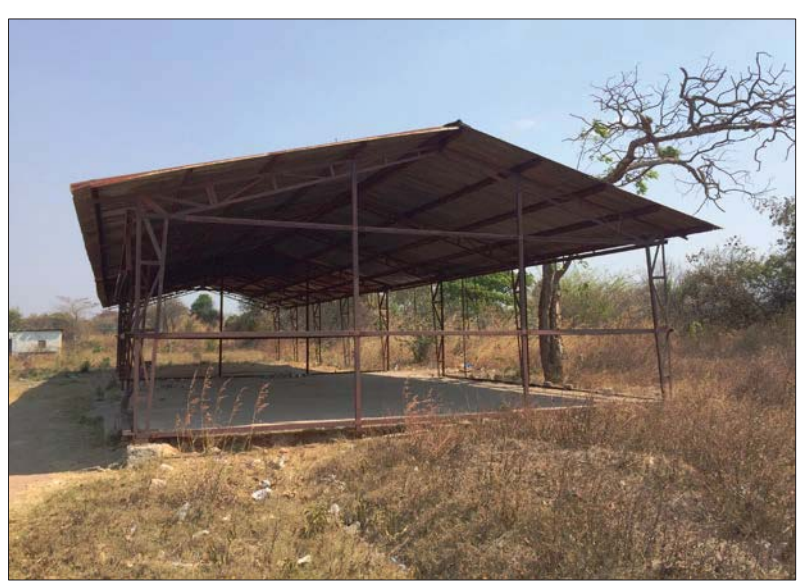
Figure 3. Building Remains