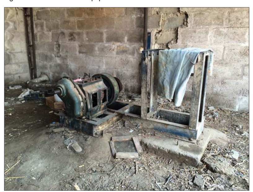
Figure 1. Broken Down Equipment

rejected in later years, current residents of the physical remains of this top-down planning scheme lament, in the words of Piot, "their point of entry into the modern and the global" (2010: 162). The end of modernist development meant the loss of foreign investment, the disappearance of technical advisors, and the absence of a bold vision that would drive change. During our visit, former settlers from the moshavim era insisted on showing us the decayed remains of the modernist planning – rusted and broken pipes that once brought running water into each home, the corroded equipment that lays to waste in the dilapidated storage sheds, bare foundations where buildings once stood, and malfunctioning water pumps that have since never been repaired (Figures 1–3).