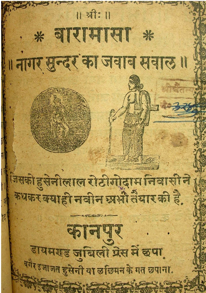
Figure 2. Hussaini Lal, Barahmasa: Naagar Sundar ka Jawab Sawal (Kanpur, s.a.)