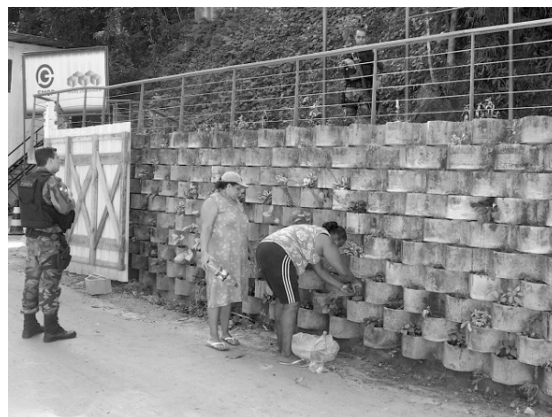
Figure 10. Planting a vertical garden with residents near the entrance to Rocinha's ecopark as UPP officers look on during their patrol.

In July that year, Amarildo de Souza, a 42 year old resident bricklayer, 'disappeared' from UPP headquarters. It was later discovered that de Souza was killed while being interrogated by the UPP. The police allegedly used electric shocks and waterboarding on the victim before suffocating him with a plastic bag. Testimonials by residents claim that de Souza's body was disposed of inside the park. A total of 25 UPP police officers were subsequently arrested and charged with de Souza's torture and the concealment of his corpse. In the months that followed de Souza's disappearance, more than 22 Rocinha residents filed reports of being tortured at the same UPP headquarters in the six months preceding his disappearance [100].