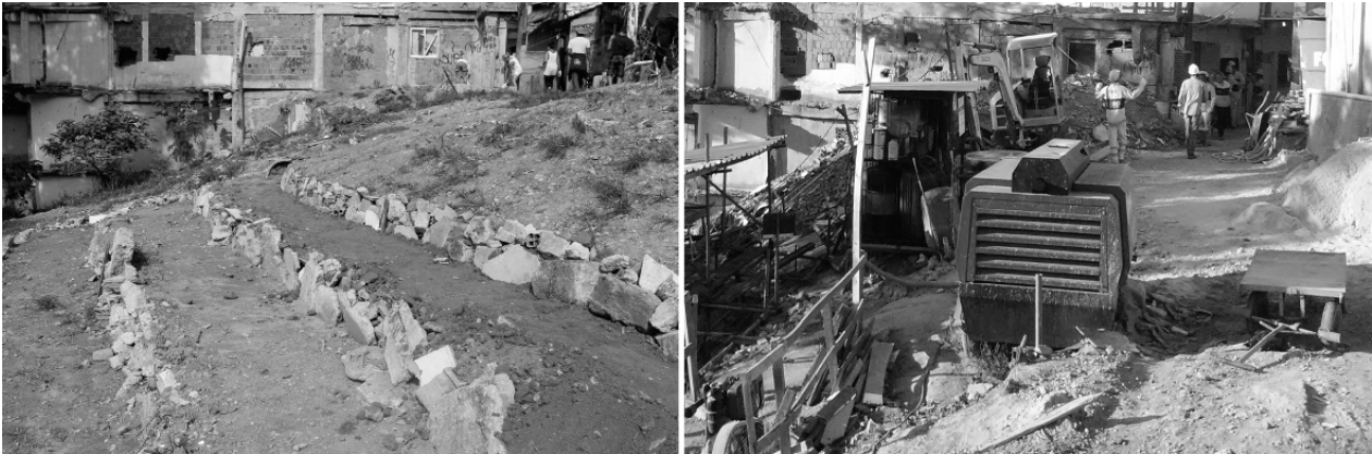
Figure 13. Laboriaux garden terraces, prepared for planting (left) and after the SMH moved onto the site (right).