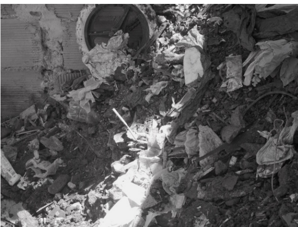
Figure 5. Trash buildup in the soil at the Rocinha Mais Verde space.

Tio Lino had gained access to a steep, vacant lot of land around 50 m 2 that had been used for years as a garbage dump. The land was adjacent to Tio's NGO— Rocinha Mundo da Arte —on a plot belonging to the Alegria das Crianças Creche . A two meter high pile of trash had built up on top of the site and another two meters had been compressed into the soil (Figure 5).