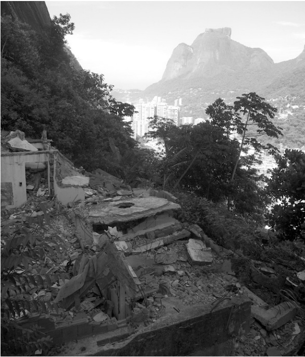
Figure 3. Demolished housing, Macega neighborhood of Rocinha.

Removals are also premised on protecting forested conservation areas. In 2008, 182 favelas encroached on, or were found to be located within 400 meters of protected environmental areas (APAs). Between 2003–2008 Rocinha expanded into its neighboring APA by 4.34%. In 2009, according to technical estimates by City Hall, there were at least 850 homes in the Vila Verde and Macega neighborhoods of Rocinha that needed to be removed because they were located in São Conrado’s Area of Ecological Interest. In Macega, according to the municipality, at least 50 houses had been built in the APA in a number of months. However Leonardo Rodrigues Lima, spokesperson for the Pro-Improvement of Rocinha Union, denied the claim, stating that “Of course in Rocinha there are people in risk areas surviving in miserable conditions. But there are no shacks in the environmental area”. Instead, he claims, it is the affluent formal residents of São Conrado and Gavea whose mansions impede on the forest [44]. Though the problem of eating into the Atlantic rainforest is important to address, City Hall’s solution—to build a series of ‘eco-walls’ around the favela to contain it—has been heavily criticized, with comparisons being drawn between Rio and Israel’s Segregation Wall. The construction of the walls also involves removals of families, which in turn has led to more unsustainable development in other parts of the Atlantic Rainforest as people rebuild where they can.