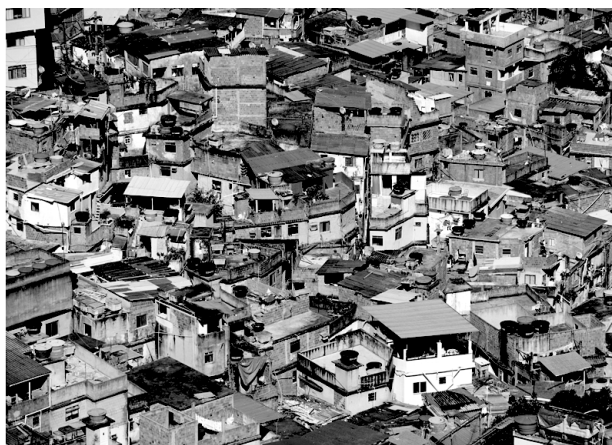
Figure 1. Detail of Rocinha favela housing.

This self-contained city is a compact concrete labyrinth comprised of dark, narrow tunnels (Figure 2) and steep winding alleys littered with mounds of garbage and snaking grey streams of open sewerage that spill down the steep mountainside to the ocean below. One congested main road twists through it from top to bottom. Motorbikes ferry residents up and down through a jumbled network of housing and commerce bubbling with lively and vivacious social exchanges taking place in the markets, stores, bars, restaurants, schools, and churches.