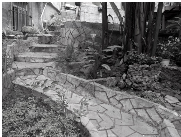
Figure 7. Rocinha Mais Verde .