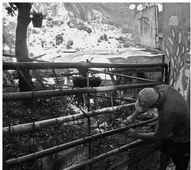
Figure 9. Resident creating a trellis on the fence at the Pedacinho da Terra garden in the Cachopa neighborhood of Rocinha.

Initially the neighbors were estranged from one another, but the interactions that occurred through the activity of gardening opened up a relationship that involved not only material production but the exchange of ideas and emotions, which evolved into a social practice and created an opening for shared cultural experience. This laid the groundwork for fostering a form of solidarity, in that it created a willingness for neighbors to take the risk of helping each other through taking on an informal form of public responsibility [84]. The importance of this is that it formed the basis for trust, cooperation, and new social ties. The garden requires little maintenance, and though it has suffered some physical setbacks (a paint spill from another neighbor's house and the theft of some edibles), it continues to receive regular upkeep from its neighbors. Due to the heavy foot traffic that moves through the area, the space continues to earn a positive response from the general public. Over time however, the general social stability of the neighborhood has deteriorated.