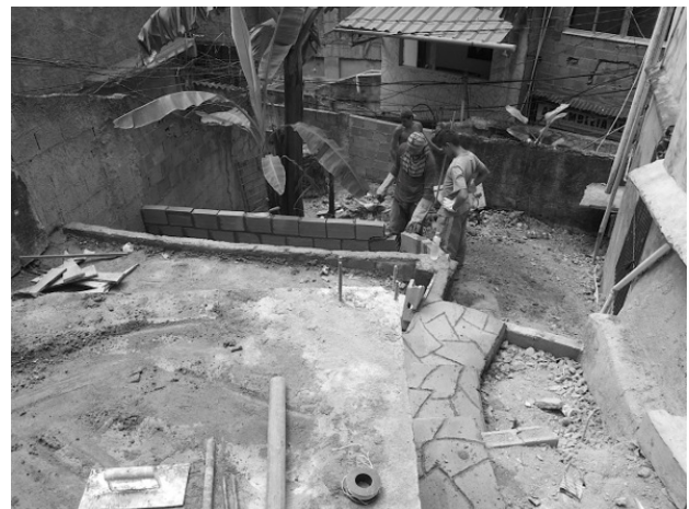
Figure 6. Terracing Rocinha Mais Verde.

Establishing security and governance over Rocinha Mais Verde proved to be complex. The project unfolded during the largest political upheaval the favela had ever seen, and the stress on the community was palpable. The garden brought attention from all sectors—police, residents, traffickers, government, and the international community. Progress became heavily influenced by security issues. First, the ADA traffickers had to approve and support the project. Then the head of the social arm of the UPP requested a meeting with GMF, which posed a huge security risk, and so was evaded. It has since been alleged that some of those who liaised with police during the early stages of the UPP occupation have been killed in gang retribution actions [70]. Others have been punished or intimidated by community members for their interactions with police.