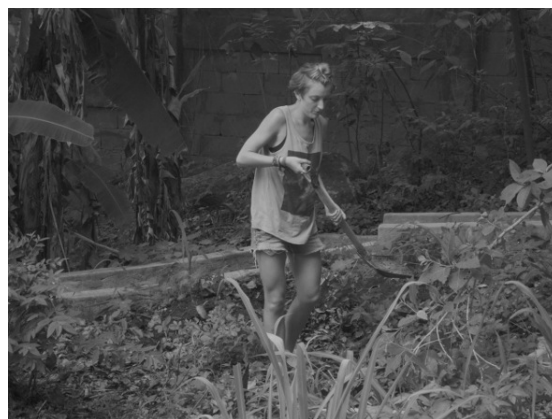
Figure 11. GMF at work in the ecopark, the 'eco/segregation wall' in the background.