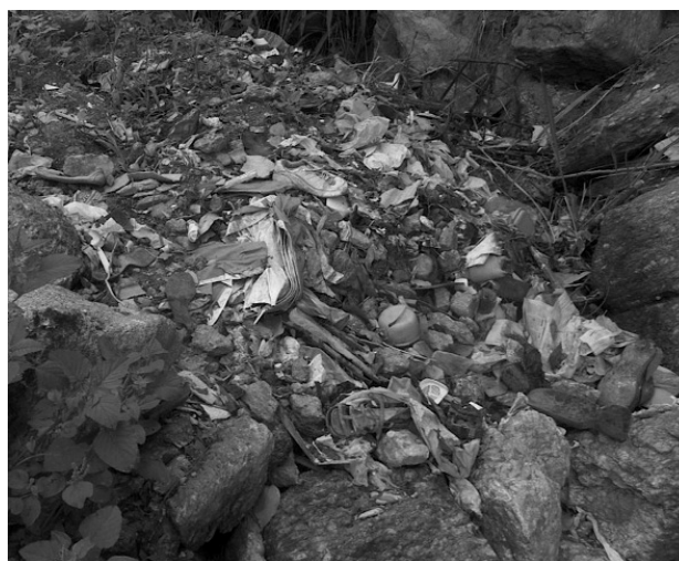
Figure 4. Trash littering the ground in Macega.

Once a site has been cleared and cleaned up, infrastructure is built—terraces, retaining walls, fences, garden beds—and water tanks installed. Soil, seeds and tools are provided, irrigation systems are set up, compost and worm bins are assembled. Advice on organic agriculture, composting, and children's workshops and planting days are held. Once a garden is fully established and the community feels ready to fully take over governance and maintenance of a space, GMF steps away from the project and continues to provide adjunct support and resources upon request. The projects rely to a lesser extent on capital investment in hard infrastructure, and more on social infrastructure (human and social capital) as the critical assets needed to produce and maintain gardens.