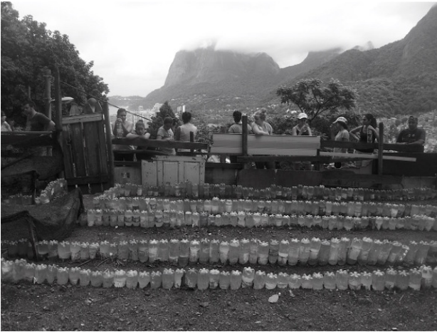
Figure 14. GMF volunteers overlooking the Hortas Cariocas Macega garden after a long workday.

The garden and orchard still provide food for the local community, however Macega remains critically neglected and underserved. The ADA have resumed control of access to the area at one major entry point. This location is now guarded by heavily armed traffickers. Exchanges of gunfire continue, either due to inter-factional fighting or clashes with the UPP. At this point in time, access to the upper part of Macega, where the garden is located, is now restricted by the Department of Civil Defense.