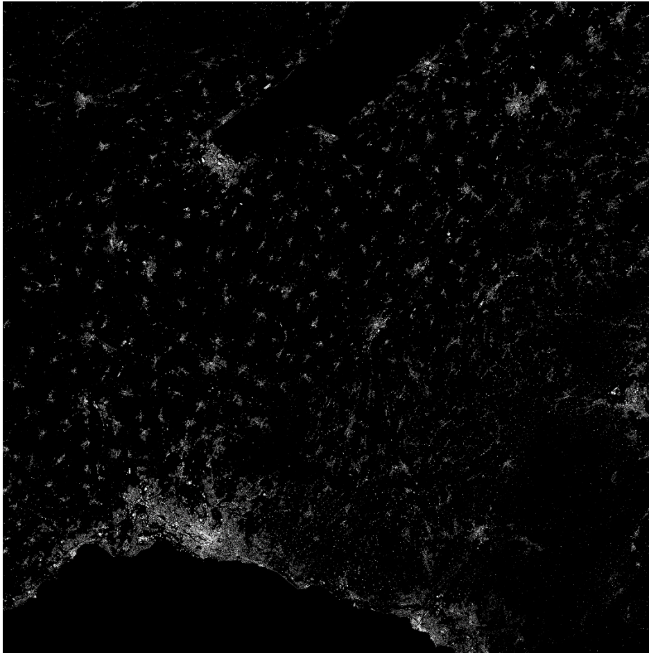
Figure 2. Canton of Vaud (2014), portion. 50x50 km: urban morphology: built (white).

nessing an important transformation process which is likely to strongly modify its spatial and social character. The fundamental question, as in many other places in Europe, concerns the future of the industrial activities and the risk of overestimating the role of the tertiary economy. The urban “fabric,” made up of villages, dormitory areas, rapidly transforming industries and vast agricultural plots, is extremely fragmented and heterogeneous. Transportation lines such as railways and highways running East-West interrupt already weak ecological networks (mainly watercourses and forests) which, on the contrary, run North-South. The West of Lausanne also contains the vast campus of two big universities dedicated to research and education, a space/economy that is becoming increasingly strategic for the Lausanne area.