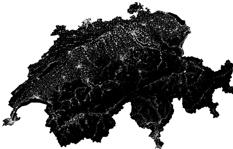
Figure 1. Urban Switzerland in 2014: built (white). Source: Horizontal Metropolis, a radical project , Venice Architecture Biennale 2016, Atlases.

In this framework, Switzerland appears to be set to put into force a gradual stiffening of its planning prescriptions and territorial strategies, in order to steer its landscape increasingly towards the concentration of its urban formations—with the danger of gradually diverting attention from “the rest of the territory” and producing territorial as well as socioeconomic marginality. The risk is that by adopting a mainstream conception of what its urban future and its growth model ought to be, Switzerland might gradually neglect and fail to maintain and renew the impressive infrastructural capital, as well as the associated natural and spatial capital, that has made its urban patterns so conducive to an unpolarized, polycentric, territorially egalitarian way of life. A novel set of concepts and actions is therefore needed in order to produce visions and operational tools capable of addressing future urban challenges, of overcoming paradoxes related to the current urban condition, and of critically re-considering mainstream debates about Switzerland’s future urban growth.