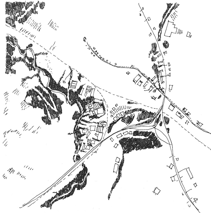
Figure 4. “Reestablishment of territorial connectivity.” West Lausanne Area: creation of new continuities between forested areas and industrial spaces. Insertion of new strategic urban axes and repurposing of the existing highway (integrated within the territory). Source: Horizontal Metropolis, a Radical Project , Venice Architecture Biennale 2016, Atlases.