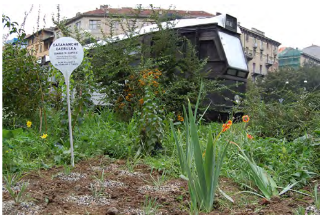
[Fig. 4] Critical Art Ensemble in collaboration with Parco Arte Vivente and workshop participants, New Alliances , 2011–12. Completed transplantation.