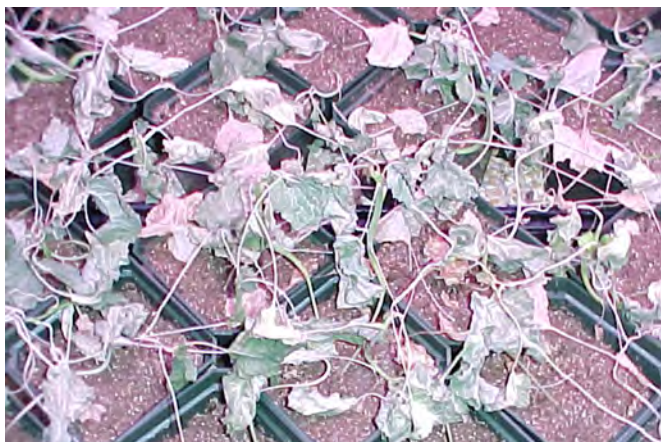
[Fig. 2] Critical Art Ensemble and Claire Pentecost, Molecular Invasion , 2002–04. Dying Roundup Ready plants.