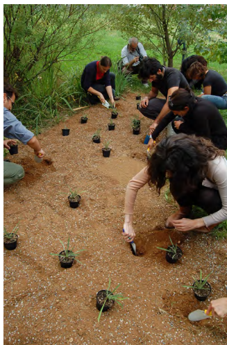
[Fig. 3] Critical Art Ensemble in collaboration with Parco Arte Vivente and workshop participants, New Alliances , 2011–12. Transplanting the endangered species Cupid's Dart in a contested public space.