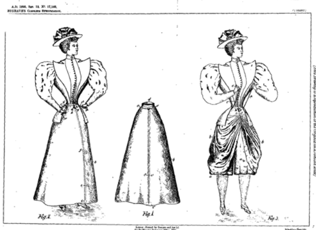
[Fig. 1] Illustrations of Alice-Louisa Bygrave's patented cycling skirt (Source: Bygrave 1895).

What is particularly relevant to discussions about socio-technical interventions is the location of these convertible devices in the garment. They were hidden inside skirts: in the seams, behind the waistbands, stitched into the hems, and hidden in gathered fabric. Concealment was central to the design. The nature of the garment would reveal itself only if and when the wearer desired it. What this also means is that the convertibility of these costumes was difficult to discern from the outside, on the surface. As evident in the larger research project in which examples of these costumes were made and worn, many of these designs only make sense on and with the body (Jungnickel 2017). This is one reason why no surviving artifacts from this period have been found (as yet) in British museums or galleries. These women did their jobs so well in deliberately concealing the nature of these garments that it makes it hard, if not impossible, to see and know the value of these designs if you are not specifically looking for them.