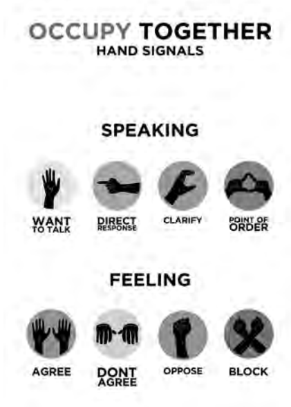
[Fig. 1] Occupy Hand Signals.

96 dynamics. 13 And there were sets of rules, too, regulating how to find out what to agree upon—rules that were always open to change, but could be referred to, nonetheless, like the “modified consensus” or the set of hand gestures [fig. 1, 2] (Gould-Wartofsky 2015, 8)—so it is not simply a super majority (as opposed to the 1% of the population that owns more than half of the country’s wealth 14 ) that the slogan “We are the 99%” invents, but new mechanisms for communication among people, one might say: new political technologies.