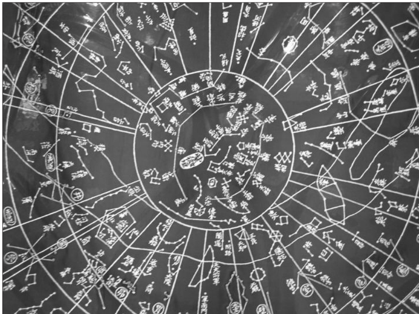
PLATE 1.1: A detail from a Chinese astronomical chart, dated 1247 CE. The original is carved in stone and rests in the Confucian temple in Suzhou, Jiangsu Province, China. In sum, it shows 1434 stars and is one of the best existing such charts from this period.

This kind of intellectual synthesis has taken place since ancient times, whenever humans tried to explain their place in the world. It happened when indigenous peoples used their deep territorial knowledge to craft not only tools and techniques for survival but also when they assembled