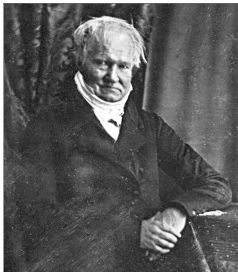
PLATE 1.2: Alexander von Humboldt, 1847.