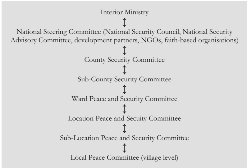
Figure 2. Kenya’s Devolved Peace and Security Institutions

velopment Network), international organisations (Saferworld, Mercy Corps, etc.), and development partners (for example, USAID). 15