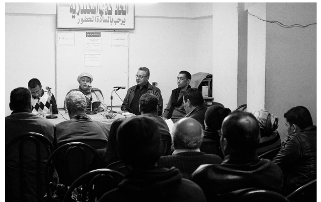
A symposium in the Writers' Union (dedicated to the novelist Saadiya Khalifa, second from left on podium), 15 March 2015.

The very categories »conservative« and »avant-garde« are unstable, subject to a constant generational transformation. Genres and aesthetics that are conventional today, once were avant-garde – such as the blank-verse metred poetics of taf'ila . 14