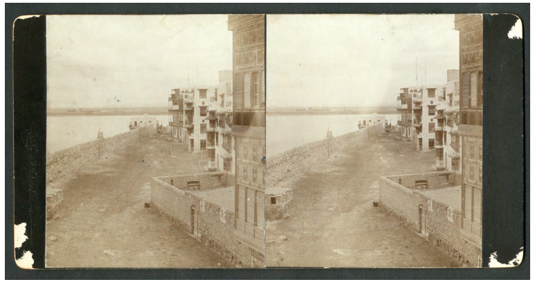
19 Jeddah: seen from the Dutch Consulate: right- part of the French Consulate; adjacent, the English; next: the Austrian. The white building at the end of the wall is a police post, January 1906

65 Picture 18, collection Snouck Hurgronje, Cod. Or. 12.288 CSH N.12.