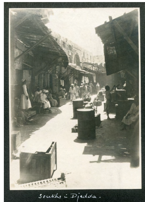
16 Sūqs in Jeddah, 1926

Mecca by bus was discussed in Jeddah in 1910, in parallel to speculations surrounding the possible construction of a raillink between the two cities which was considered a supplement to the Hijaz railway. 62 In March 1911, the British consul reported that an omnibus had arrived from Liverpool, originally destined for the transport of pilgrims between Mecca and Arafat, but that the buyer had refused to accept it because vehicle turned out to be a defunct second-hand item. 63