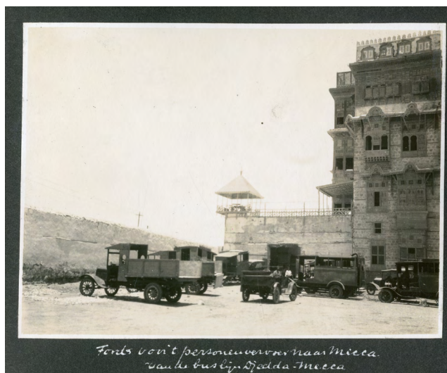
1 Fords for passenger traffic to Mecca of the bus service Jeddah-Mecca, March 1926

and authentic ways of representing the real», 11 and it might indeed have been this very perspective which encouraged Snouck Hurgronje to use the technique as one of the methods of his ethnography. Thus, it has been argued that already his »Bilder-Atlas« (pictorial atlas), the title chosen for his collection of pictures, illustrates this documentary desire. 12 Among the photographs chosen below for a discussion of selected aspects of late Ottoman, Hashemite and early Saudi Jeddah are, as mentioned above, a number of pictures taken by other people, usually members of the Dutch community or travellers who were in touch with the Dutch consulate and/or Snouck Hurgronje. If they are treated in the following essay in a fashion similar to the one's taken by Snouck Hurgronje himself, it is mainly because they seem to reflect quite a number of interests expressed by Snouck Hurgronje in his writings, and because they are clearly linked to themes or people with which he was concerned in his local observations.