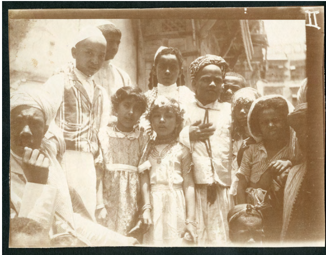
3 Kleine Feest (The »minor feast«) , unknown date

What is, with regard to the ethnography of Jeddah, of great interest are the photographs linked to the end of the breaking of the fast at the end of ramaḍān contained in the collection. 35