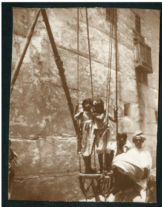
4 Children on swings, unknown date