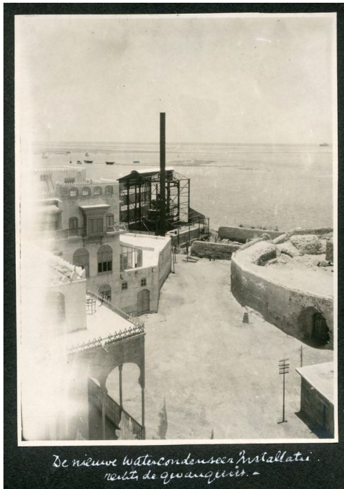
17 The new water-condensator, to the right the prison, March 1926

Nevertheless, it took a long time until piped water reached the quarters and later individual houses. Until then, the water tanks of the houses were regularly filled by water carriers who brought the precious good from the various sources of supply to the houses by camel or donkey, as in photo 18 by an unknown photographer. 65