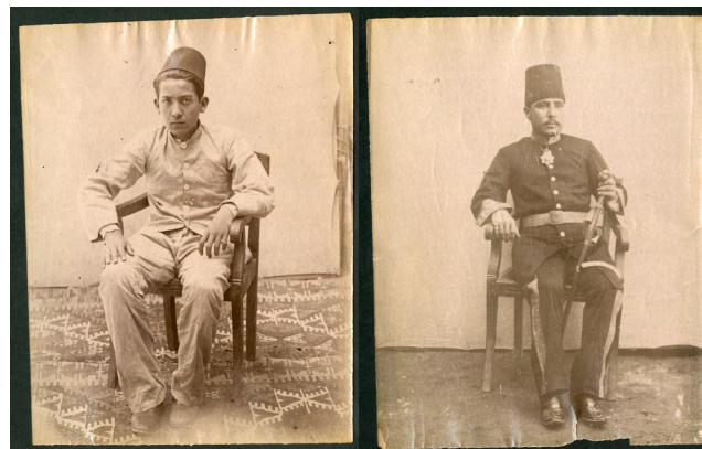
10 Policeman, date unknown

In comparison to the long robes of the Hijazis, Ottoman officialdom must have appeared distinctly foreign, and possibly Western, ranging from the odd portrait of the policeman in photograph 10 the image of whom seems to reflect the rather low status of such Ottoman officials to the more dignified, as in the image of the chairman of the Commercial Council ( majlis al-tijāra ) in photograph 11. 47