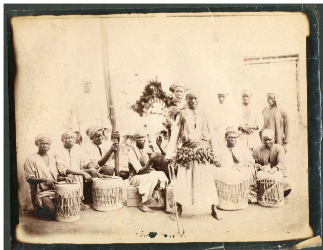
6 Slaves with Tumbura (Jeddah), 1884-85

On many of these festive occasions, religious and secular, as well as at family parties such as weddings, a variety of music was played and dances performed. While photograph 6 shows a dancing boy, Snouck Hurgronje himself took a number of photographs of musicians with their instruments. 40