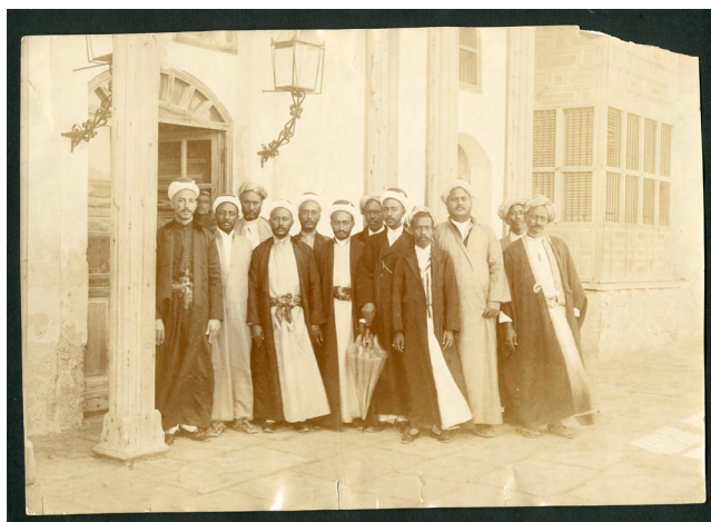
9 Some agents for pilgrims in front of the Dutch consulate in Jeddah, date unknown