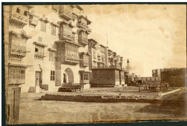
15 Street in Jeddah date unknown

Snouck Hurgronje himself does not mention many of the sights of the city in which he spent five and a half months, staying, until his conversion to Islam, at the Dutch consulate. 58 This might, at the time, have been housed in a building similar to the one in this photograph, possibly taken by Snouck Hurgronje himself. 59