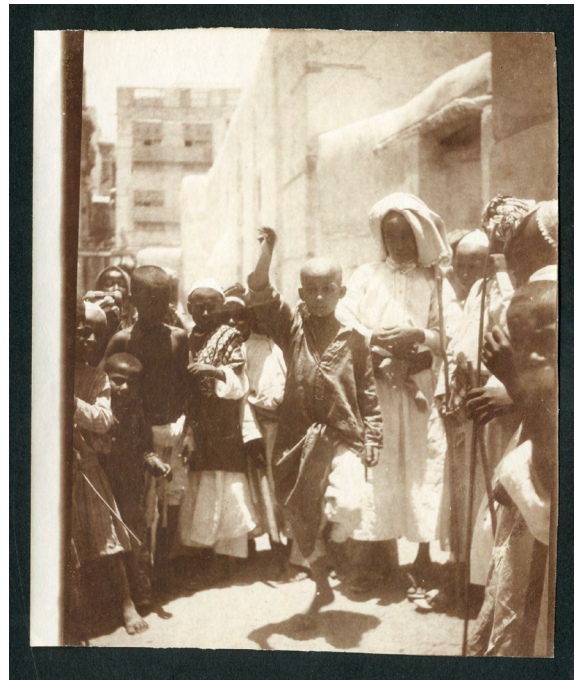
5 Children in the street, dancing (subtitle U.F.), unknown date

35 Pictures 3-5, collection Snouck Hurgronje, Cod. Or. 12.288 CSH M.35 (entitled »kleine Feest«), M.36, M.39.