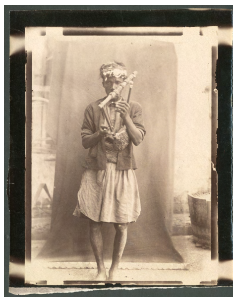
7 Musician from Jeddah, 1884-85