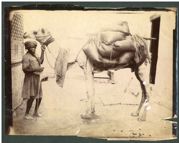
18 Water carrier, date unknown

Nevertheless, it took a long time until piped water reached the quarters and later individual houses. Until then, the water tanks of the houses were regularly filled by water carriers who brought the precious good from the various sources of supply to the houses by camel or donkey, as in photo 18 by an unknown photographer. 65