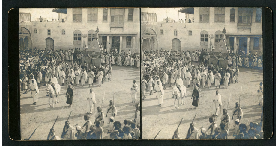
2 Arrival of the Maḥmal in Jeddah, unknown date

by contemporaneous Wahhabi scholars was at that time a matter confined to their domains in the Najd.