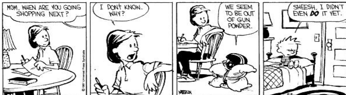
Fig. 1: Calvin and Hobbes: On Gunpowder