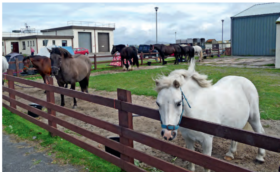
Photo 6: Horses of the Uist Community Riding School (Jacuniak-Suda 2010)

cal decision-making is very important. However, certain groups, such as young people and children, should be encouraged to participate more than they have done so far. Little has, however, been done by these SEs to promote cultural distinctiveness and enhance historical heritage in terms of concrete long-term