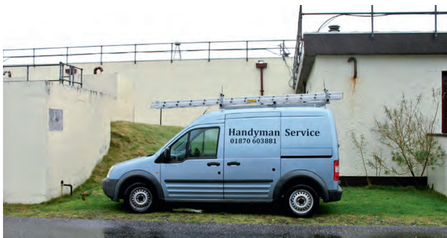
Photo 2: Handyman service of Tagsa Uibhist on the former RAF Benbecula station (Tagsa Uibhist 2013)

Major challenges facing the selected SEs include obtaining matching funding to complement public sector core funding. Another challenge presents sustaining new jobs and services as well as the