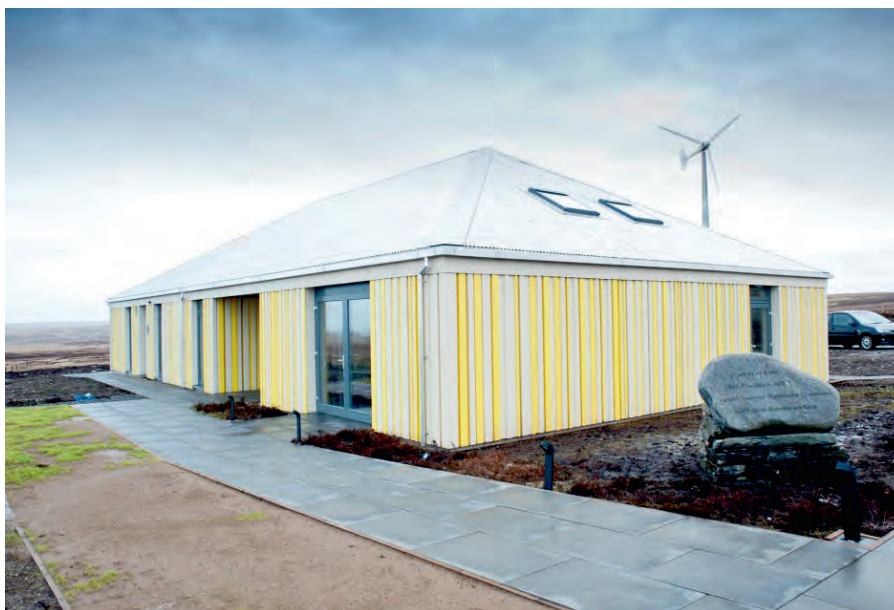
Photo 9: New zero carbon business centre on the Galson Estate Trust Estate (Galson Estate Trust 2013)

Regarding contributions of SEs to economic, social and environmental sustainability, our own findings can be discussed especially in consideration of the findings of HAUGH (2006) as the aim of her study was to examine SEs with regard to economic, social and environmental regeneration. As the aim of regeneration is closely linked to the sustainable development objectives, a common ground exists for a comparison of results. HAUGH (2006, p. 200) observed that SEs in the north-east of Scotland have direct economic outcomes which include the creation of new organisations, employment opportunities and income. The indirect economic outcome relates to raising the skills levels of the local population. These findings support the findings of this pa-