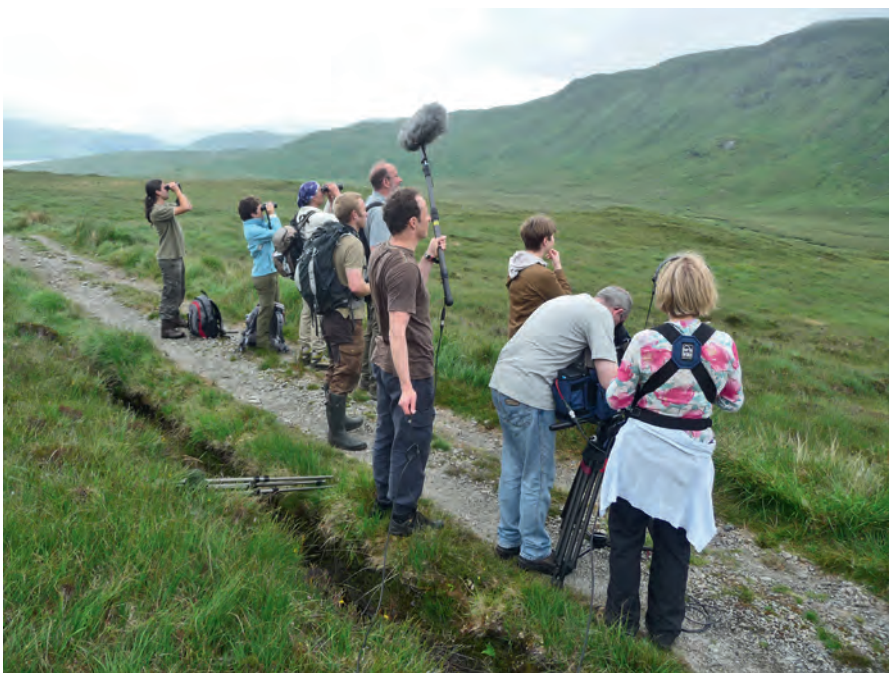
Photo 8: Golden eagle guided walk with the assistance of the BBC Alba (Jacuniak-Suda 2012)

Recycling is also high on the agenda of SEs. Galson Estate Trust, North Harris Trust and Barra and Vatersay Community Ltd run skip and recycling services on behalf of the Western Isles Council. Furthermore, the three social enterprises promote the use of renewable energy, and, in doing so, contribute to reductions in CO 2 emissions. The newly built office premises of the North Harris Trust and the Galson Estate Trust were designed to be energy efficient. In the medium term