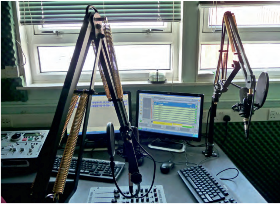
Photo 7: Broadcasting studio of the Voluntary Action Barra and Vatersay (Jacuniak-Suda 2010)

people are registered on the “Dial a Bus” service.