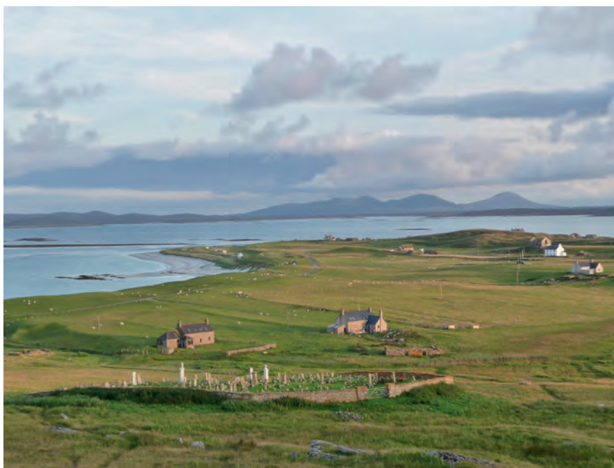
Photo 1: Rural landscape of Berneray, North Uist (Jacuniak-Suda 2010)

of this development is strongly connected to the significant changes that have come about with the Scottish land reform functioning as a catalyst for local people to organize in a bottom-up process. According to legislation implemented in 2001 under the Scottish Land Reform Bill local communities are given the right to buy out their land and thereby overcome the nearly 900 years history of quasi feudal land rights (SCHMIED 2001). In the meantime, supported by government funding, an increasing number of community groups have taken advantage of this option