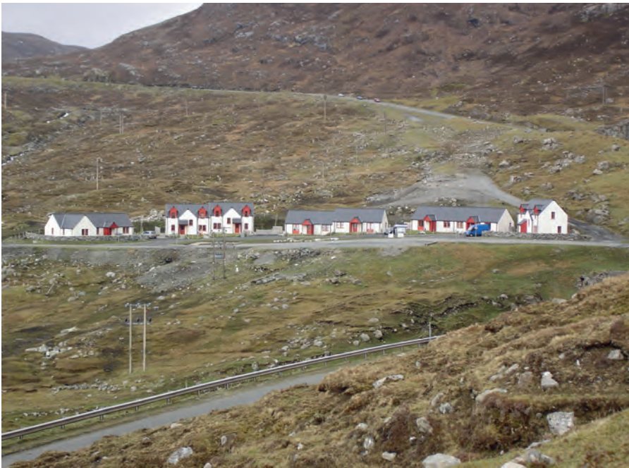
Photo 3: Social housing on the North Harris Trust Estate

reduce energy consumption and provide cheaper energy for rural areas. The Community Carbon Challenge project in North Harris Trust provided between 2009-2011 extensive help to houses within the community of North Harris to lower fuel bills, by installing energy saving measures such as roof and cavity wall insulation (NHT 2013).