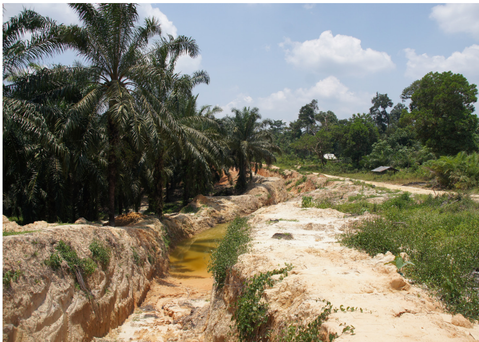
Picture 2: A new frontier is set; trench designating the border of the oil palm plantation PT Asiatic Persada. 26 September 2013, Bungku village.

important in sustaining livelihoods, traded for sandal wood, rattan, resins, natural dyes, and also gold. In the nineteenth century, these forest products were traded as far as India, the Arab World, and China (Locher-Scholten, 2003, p. 276). Until the present day, the Batin Sembilan follow the concept of collective customary land ( wilayah adat ). 10 Historically, this land use system was combined with frequent movements on this land for economic and cultural reasons (Colchester et al., 2011, p. 9).