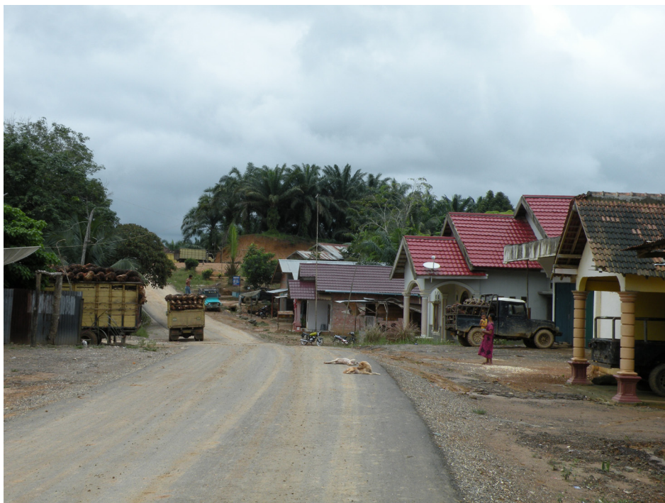
Picture 1: Main road of Bungku village. 20 March 2013, Bungku village.

This quote illustrates the severity of land conflicts on the village level as each ‘time bomb’ represents one major land conflict. Located 85 kilometers southwest from the provincial capital of Jambi city (see Figure 1), Bungku village was founded in the 1970s as a resettlement project for the indigenous semi-permanent Batin Sembilan group. In 2011, the village population comprised 2,864 households and a total population of 10,215 people (BPS Kabupaten Batanghari, 2012, p. 18). Bungku consists of five hamlets ( dusun ) and 32 neighborhoods ( Rukun Tetangga , RT) (see Picture 1). The inhabitants are mainly peasant farmers cultivating rubber and oil palms as cash crops in addition to vegetables for their own consumption. Households hold about five hectares of land on average; major non-agrarian sources of income are from small businesses such as grocery shops, food stalls, and repair shops.