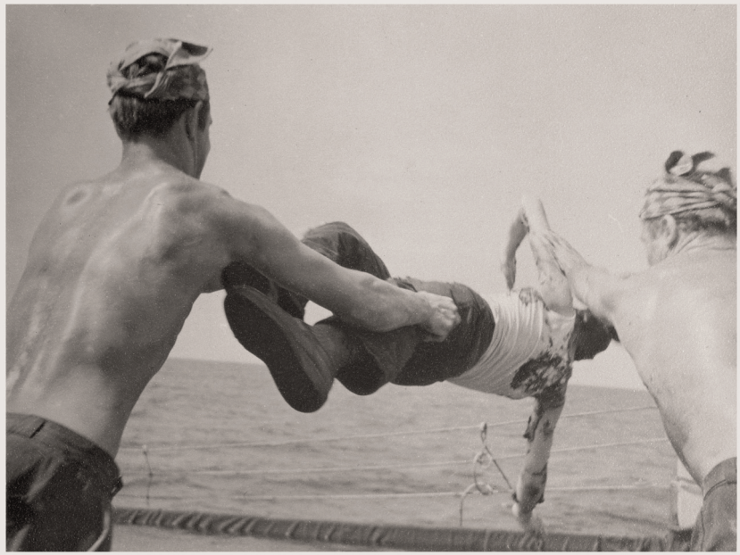
Hazing of sailor during Neptunusfeest on S.S. Amstelpark

is fast'ned, and hoised up three times at the main yard's end, as if he were a Criminal. If he be hoised the fourth time, in the name of the Prince of Orange , or of the Captain of the Vessel, his honour is more than ordinary. Thus they are dipped, every one, several times in the main Ocean. But he that is the first dipp'd, hath the honour of being saluted with a Gun. Such as are not willing to fall, are bound to pay twelve pence, for their ransom: if he be an Officer in the Ship, two shillings: and if a Passenger, according to their pleasure. In case the Ship did never pass that way before, the Captain is bound to give a small Runlet of Wine; which if he doth not perform, the Mariners may cut off the Stem of the Vessel. All the profit, which accrueth by this ceremony, is kept by the Masters Mate;