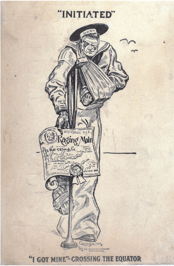
Postcard entitled 'Initiated.' The subtitle of "I Got Mine" – Crossing the Equator' has the double meaning of the certificate and the beating. 1907, Middletown, Connecticut, USA.