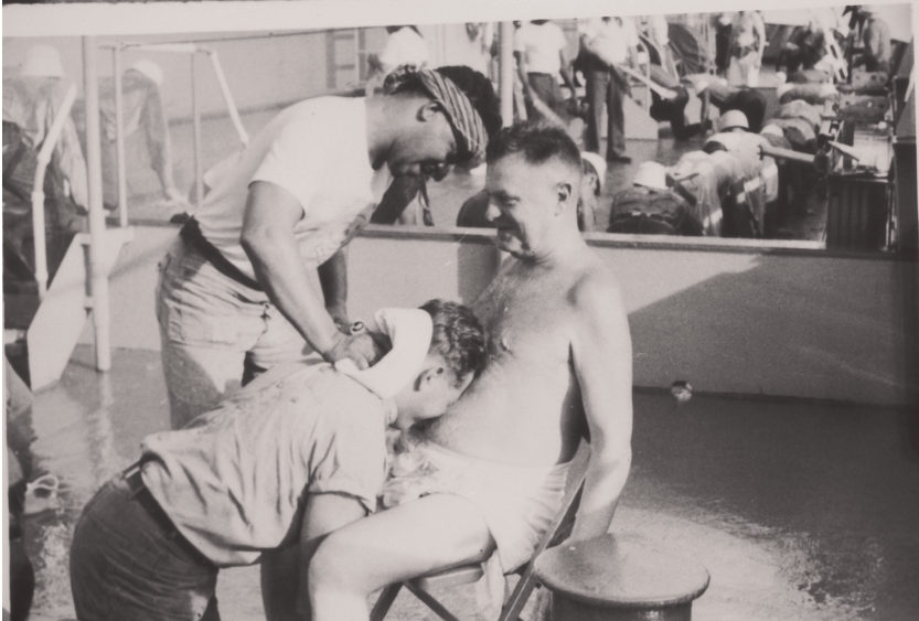
Kissing the Royal Belly covered in raw eggs and oysters, USS Oxford, 1966

mother to fear of the repressive, revengeful father. To effect manliness at sea, especially given the view that maternally dominated, landed civilization is feminized and soft, and the military insecurity about homosexuality in an all-male environment, female figures, or men in feminized positions, are sexually dominated and ridiculed. Dealing with the often unconsciously internalized insecurity that sailors take on feminine roles on board, female (and the sodomized male) characters are externalized, ejected from the self; they are performed in Wog Queen contests, dog auctions, and homosexual enactments as ridiculous, passive, weak, and scared. 95