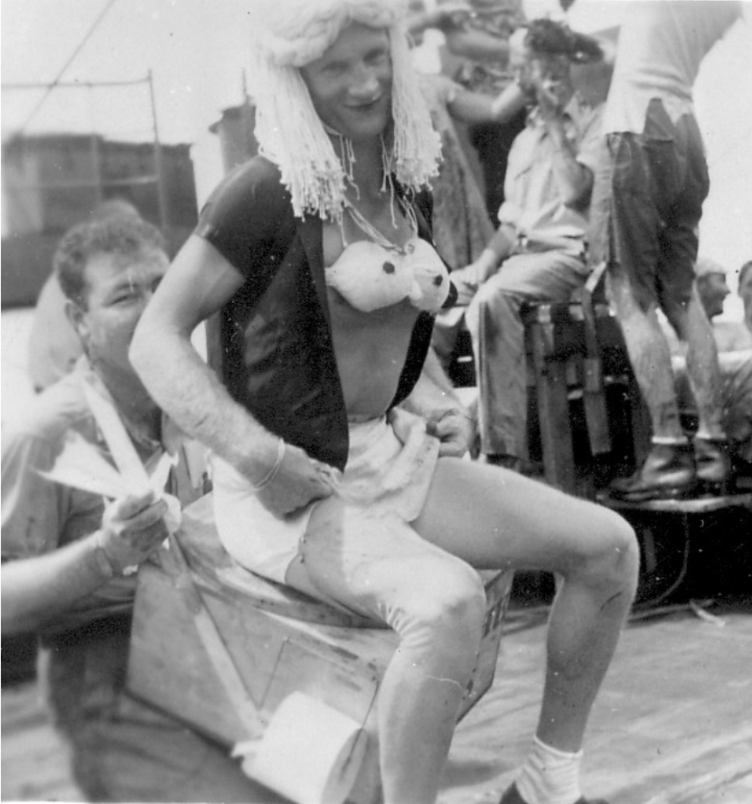
Pollywog in drag on Wog Day sitting on mock toilet seat

logical compact, an 'order of the deep,' with the fatherly Neptune, rather than with a princess. Women are equated with the pollywog, an identity intended to be repressed. The Wog Queen contest, for instance, emphasizes the femininity, and therefore weakness, of the wogs. Contestants draw laughter and ridicule, because they suggest