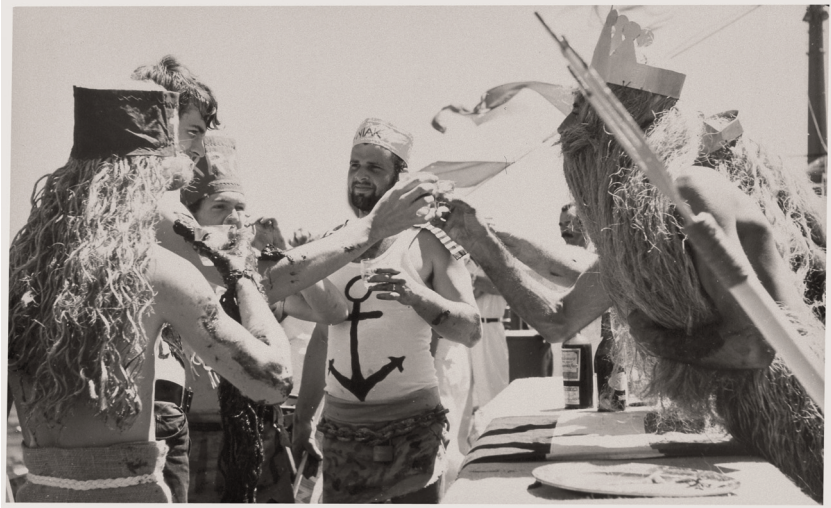
Offering of drinks during Neptunusfeest on M.S. Amstelveen

traditional ('accoustemees') and viewed as a response to the 'fascinating and dangerous voyage.'