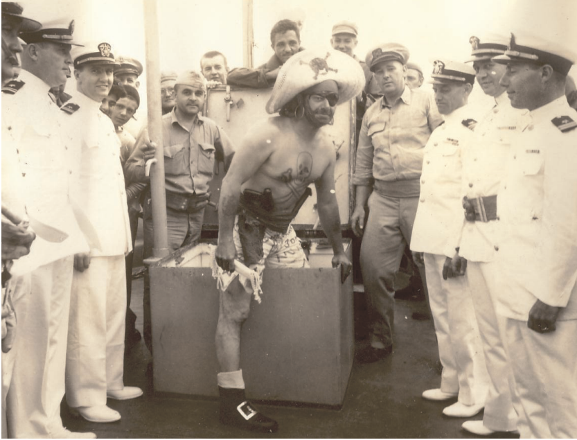
Entrance of Davy Jones day before crossing of equator, USS General A.E. Anderson, 1944

they are real city slickers. But no matter, all will be shellbacks after the rough treatment on the morrow, at which time, those summoned will appear before the Royal Judge of His August and Imperial Majesty, Neptunus Rex, and there answer for offenses committed both aboard and ashore. Captain, a few officers and men have already requested leniency, but be it known King Neptune has no favorites. All landlubbers since men first followed the sea have endured the strict initiation required by the King of the Sea. No! There will be no leniency – all pollywogs will receive appropriate punishment on the morrow. And remember, sorrow and woe to those who resist or talk in a light or jesting manner of the ceremony, or of His Majesty, the Ruler of the Seven Seas, or of the Queen Amphitrite, or belittle Royal Members of his Supreme