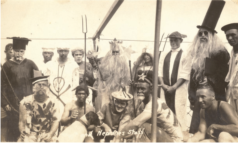
Characters in Neptune's Court, early twentieth century

winnigen ter zee, 1672-73,' following sea victories over France and England, suggesting that Neptune was pervasive in Dutch maritime folk culture, which characterized the Netherlands. 91 There is even the proposal that the visual representation of Neptune influenced the standardization of St. Nicholas ( Sinterklaas ) with beard, staff, and robes. Besides being the most popular festive figure (in England it would be Father Christmas), St. Nicholas became the patron saint of seafarers. 92