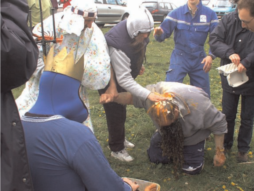
Hazing of initiate by dumping eggs over his head during Neptunusfeest of Duikteam Medusa, Netherlands, 2004

sitivity. In the Low Countries, for example, scuba diving clubs such as Duikteam Medusa are known for their own versions of Neptunusfeest in which new divers' heads are doused with flour and eggs while a crowned Neptune accompanied by two white-robed helpers presides. Their line is the liminal space of the shore, between land and sea. Their reference to danger and the unknown is in the depth of the waters. Solemnizing the ceremony, the helpers bring the initiates one by one before Neptune as judge and ruler. After Neptune gives a flowery speech, he is given reverence by both male and female initiates with a ritual kissing of the feet. Difficult tasks are then assigned to the initiates such as carrying a ball in a spoon without dropping it, catching a jam-covered apple dangling from a string without the use of hands (resulting in an embarrassing mess). While wearing a blindfold,