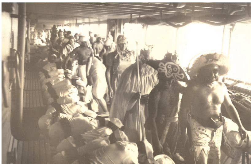
Pollywogs genuflecting in row as Neptune's Court enters ship, USS General A.E. Anderson, 1944