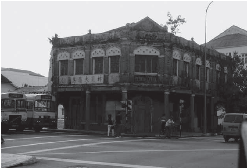
Figure 8.1 Shen Nong Medical Hall at Bras Basah Road, now demolished