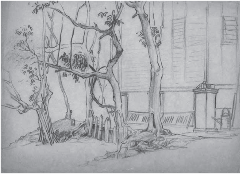
Figure 8.3 Detailed sketch of the orchard by Lim Mu Hue

one sweeping, panoramic construction. The final 1964 work in Chinese ink on sepia rice paper [ xuan paper, 宣紙] measured six by four feet. The viewpoint is located as if in mid-air at a high vantage point above the orchard, looking down at its entirety on the ground. However, the neighbouring areas of the orchard are not inscribed, accentuating focus on that space. Hsü subsequently noted that Lim had taken the liberty to remove some trees to emphasise the visibility of several key areas of the painting, but the depiction is otherwise accurate (Hsü 1967: 4).