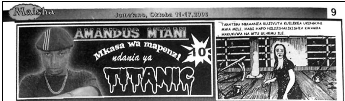
Picture 1: The continuation of the Titanic series after 6 years in the Tanzanian weekly Maisha 11.10.2006. It starts with Rose's suicide attempt.

The narration which was published in the first issue of Mkasa wa Mapenzi ndani ya Titanic ends shortly after the vessel has left the harbour and Jack starts drawing the passengers. Thereby it comprises approximately the first 34 minutes of Cameron's movie. The final box of this issue reads „usikose kitabu namba 2“ (Don't miss the book number 2).