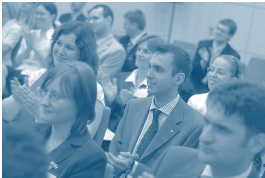
Carl Friedrich Goerdeler-Kolleg fellows

Towards the outside world, the most obvious sign of the change was renaming the institution "Carl Friedrich Goerdeler-Kolleg" in May 2007. The name serves to commemorate the excellent administrator and mayor of Leipzig, Carl Friedrich Goerdeler, who worked for Bosch from 1937 until he was executed as one of the