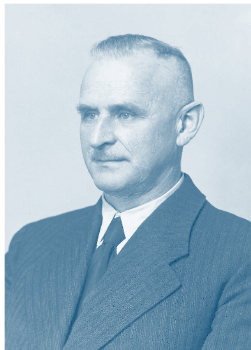
Robert Bosch and Carl Friedrich Goerdeler