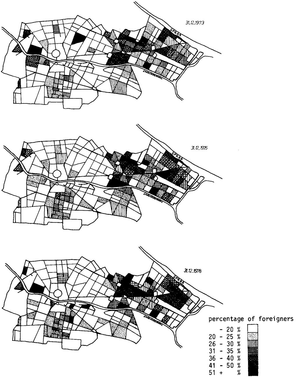
Diagram 2: Foreigners, living in the Kreuzberg District 1973, 1975, 1978